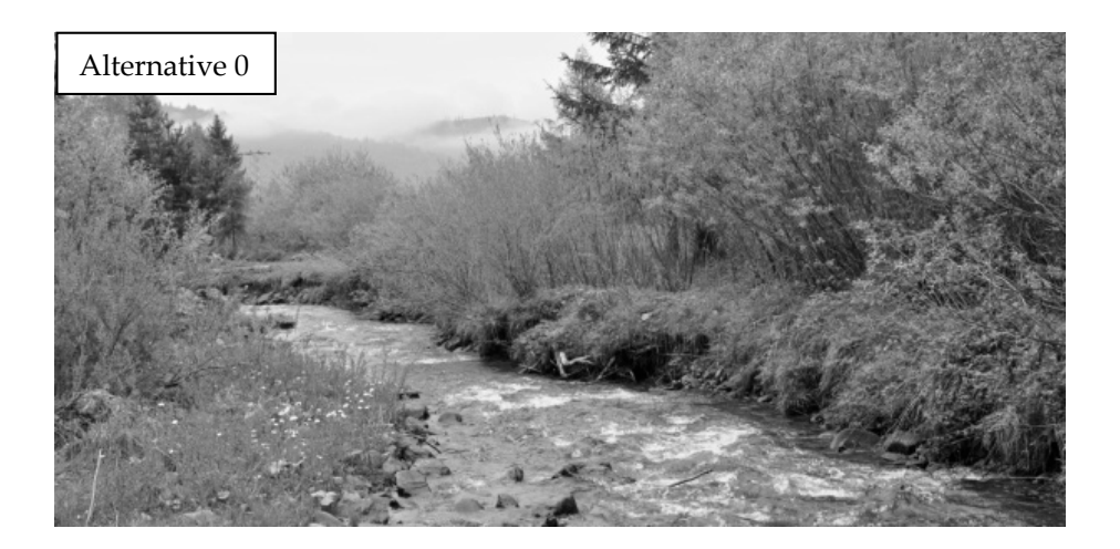
Figure 2. Cont.