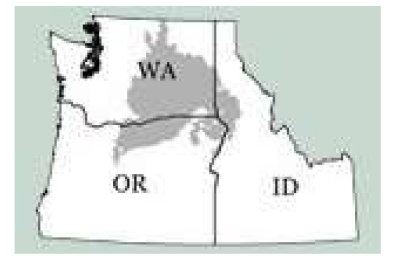
Figure 2. Regional Approaches to Climate Change in the Pacific Northwest (REACCH PNW) project area illustrating the major wheat producing region of the inland Pacific Northwest (iPNW).