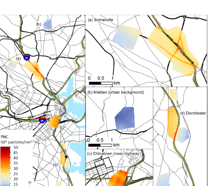
Figure 2. Ultrafine particle (UFP) level maps. The Community Assessment of Freeway Exposure and Health (CAFEH) study conducted mobile air pollution monitoring in three sets of paired neighborhoods, near the highway and >1 km from the highway (listed as ( a – d ) on the map). UFP were measured as particle number count using a condensation particle counter. The data from the mobile monitoring were used to develop land use regression (LUR) models of particle number count (or PNC, a measure of ultrafine particles) for each of the study areas. The LUR models had a resolution of 20 m and 1 h. The hourly estimates of PNC level were then averaged over a year to calculate the annual average values that are plotted in this figure.