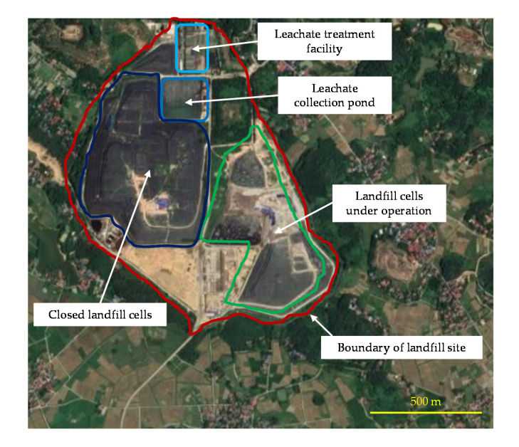
Figure 1. Nam Son landfill site (Source: 2015 Google Inc. 12 December 2020).

wastewater treatment plants used conventional leachate treatment methods, such as air stripping, coagulation, flocculation, aerobic and anoxic tanks/sequencing batch reactor (SBR), settling, filtration and disinfection; the systems required a large amount of chemicals, and the efficiency is not constant but depends on climate conditions and the volume of inlet leachate [26]. The bottom of the cells was covered with a geotextile layer that laid directly on the original ground to prevent leakage of landfill leachate into surrounding areas.