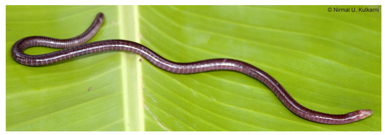
Image 1. Gegeneophis goaensis in life from Chorla Village, Karnataka (ZSI/WGRC/V/A/714)