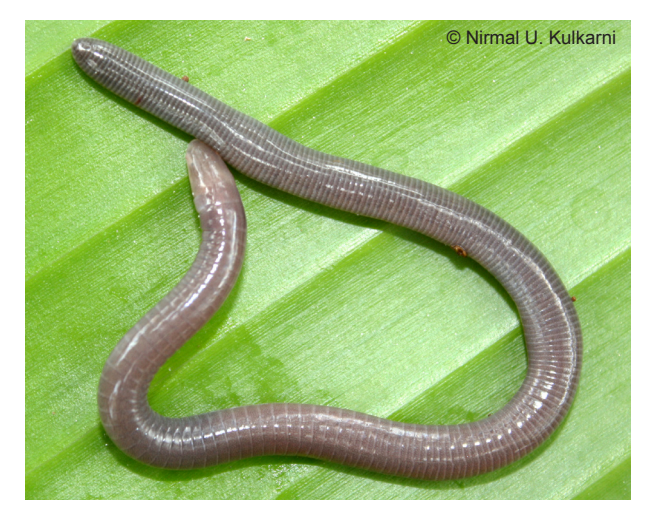
Image 2. Gegeneophis mhadeiensis in life from Maan Village, Karnataka

Although caecilians are often considered rare and thought to require pristine habitat (Gower & Wilkinson 2005), our present study reveals that systematic search in a suitable habitat with decomposing organic matter can yield good caecilian collections and also in synanthropic