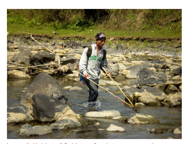
Image 3. Habitat of Schistura fasciata sp. nov. and electrofishing with locally designed equipment.

Schistura fasciata sp. nov. is close to S. khugae, S. tigrinum and S. multifasciatus in colour pattern. But