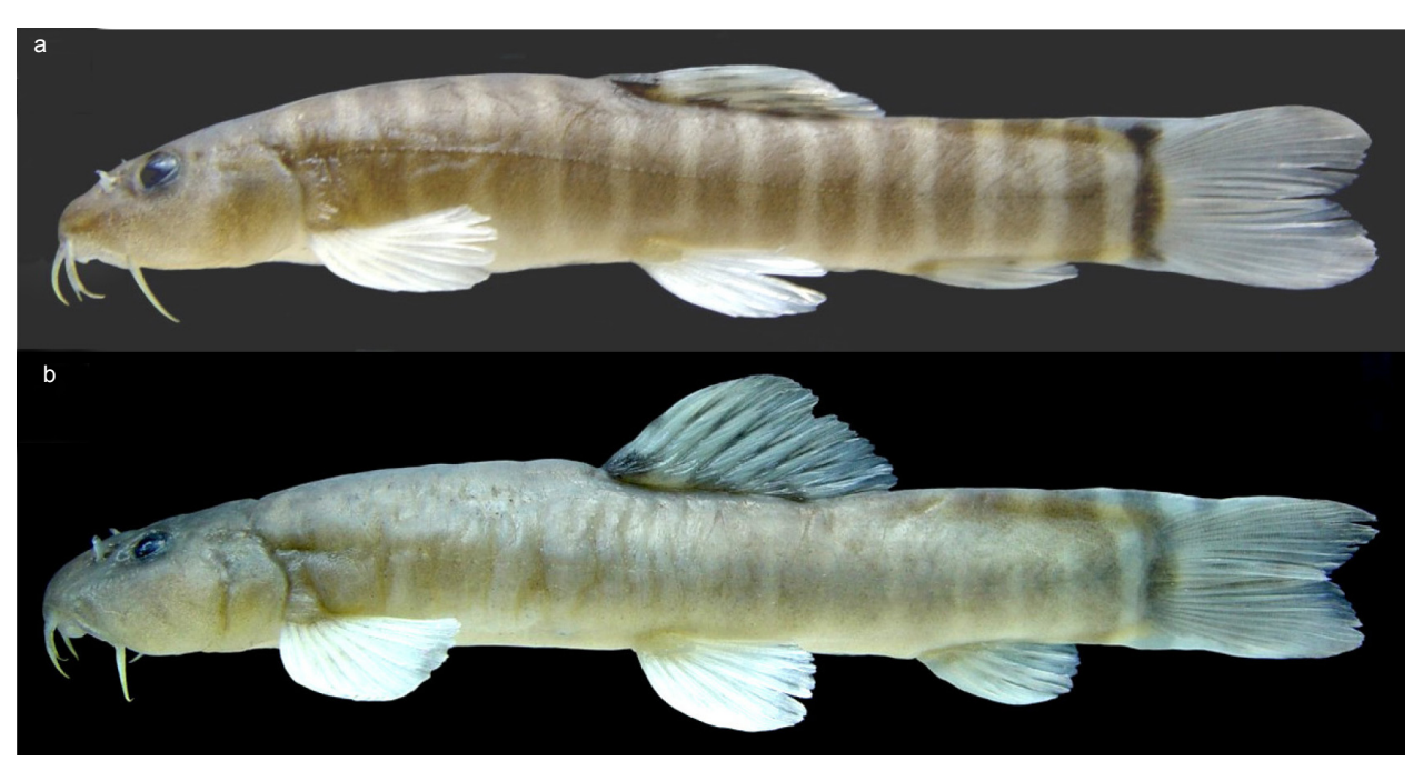
Image 1. Schistura fasciata sp. nov. a - Side view of Holotype, female, MUMF 11010, 51.5mm SL; b - Paratype, male, MUMF 11020, 68.3mm SL

A new nemacheiline fish Y. Lokeshwor & W. Vishwanath