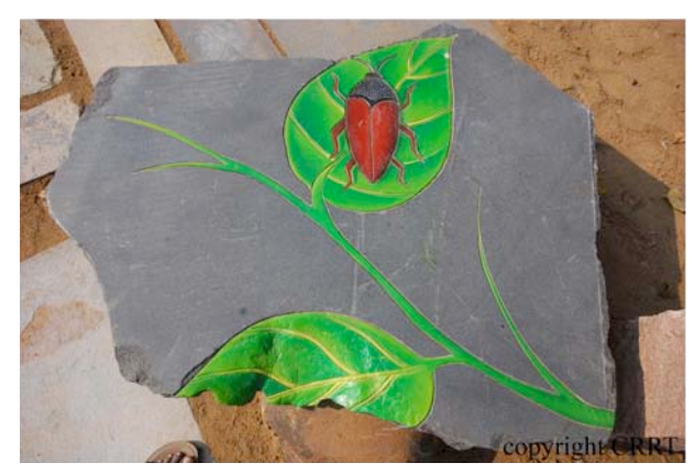
Image 12. Relief may represent form, but simple etching of outlines and painting the interior can also make a subject stand out from its surroundings. The challenge here is to use the shape of the base material to advantage and to create an 'effect'. Here the uneven edge of discarded waste from a TAMIN factory has been used to advantage. Species represented: Jewel Beetle Sternocera sp. Tholkappia Poonga, Chennai.