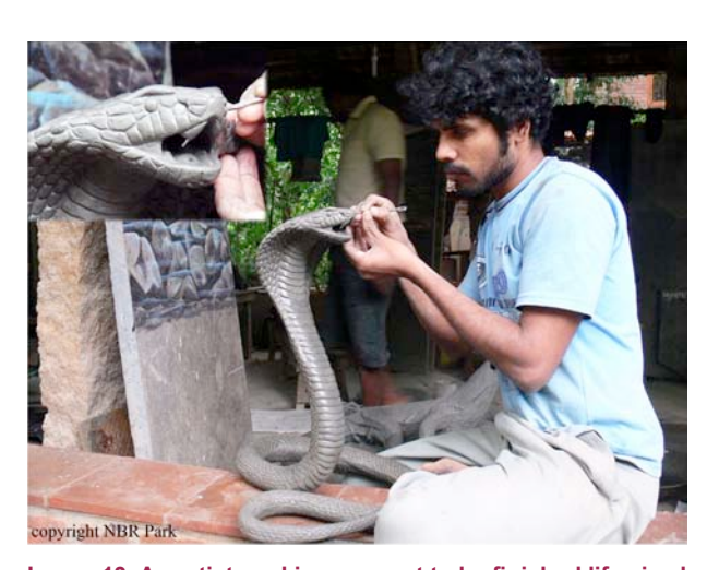
Image 13. An artist working on a yet to be finished life sized ferro cement model of an Indian Cobra Naja naja . Detail is crucial to such efforts – every scale has to be faithfully represented, including the small cunate scale among the infralabials. Commissioned by Nilgiri Biosphere Reserve Park, Anaikatti.