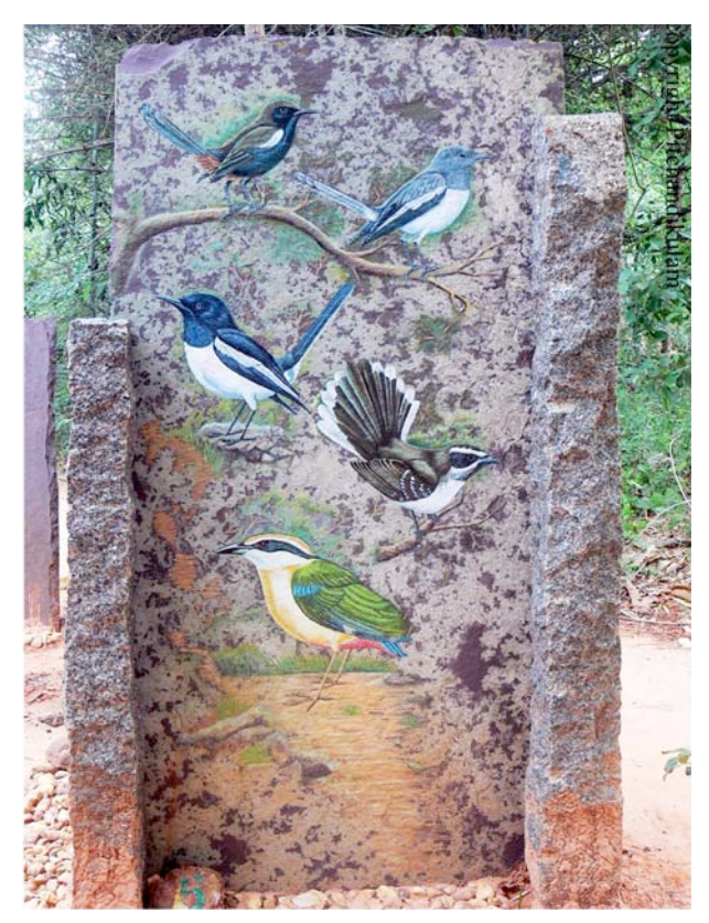
Image 3. Mild tampering is sometimes required to make a point – in this case to represent different niches occupied by birds in a coastal forest along the southern Coromandel Coast. That is why the ground has been painted in, but very minimally. The natural 'cloudy' tone of the stone has been maintained to represent foliage. A minimal amount of green was used to make the subject stand out from the background. The use of rough cut granite pillars to frame the slab is another added touch. Species represented are Indian Robin Saxicoloides fulicata, Oriental Magpie Robin Copsychus saularis, White-browed Fantail Rhipidura aureola and Indian Pitta Pitta brachyura. Pitchandikulam Forest, Auroville.