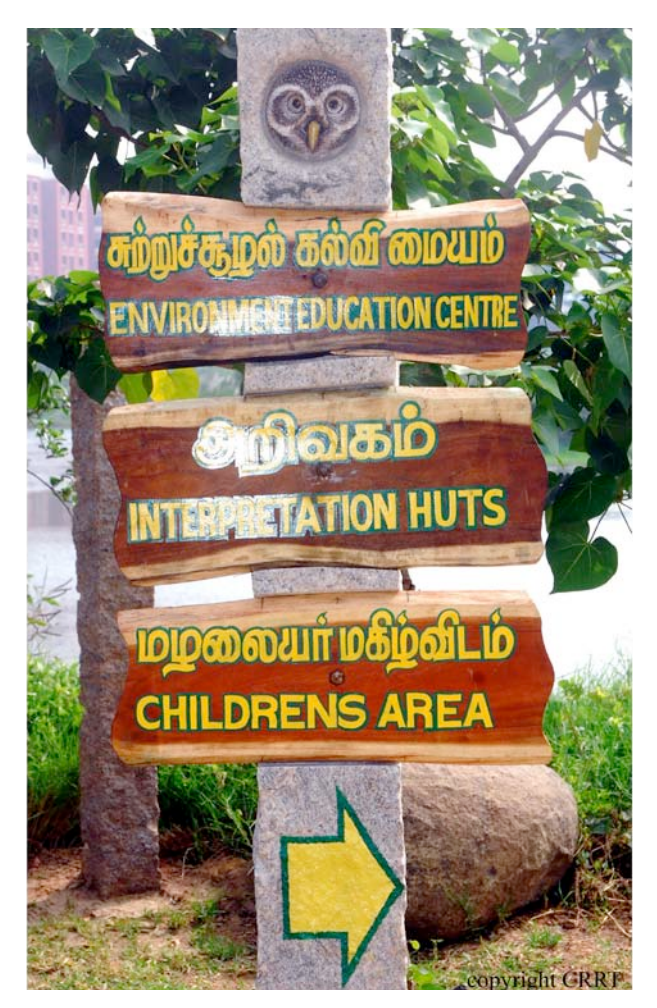
Image 7. A carved and painted Spotted Owlet Athene brama peering out of a cavity tops another rough hewn granite pillar to which planks with directional signage have been affixed. Tholkappia Poonga, Chennai.