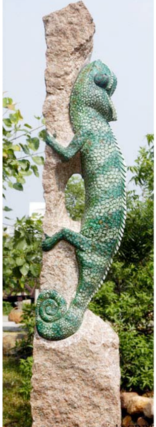
Image 5. Vertically implanted rough hewn granite pillars carved and painted over was found charming. This is a scaled up version of the Indian Chameleon Chamaeleon zeylanicus nearly 1m long. Tholkappia Poonga, Chennai.