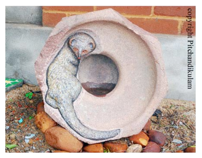
Image 8. Sometimes even waste can be utilized – in this case a disused mortar has been carved in relief and painted over to represent the Grey Mongoose Herpestes edwardsi . The challenge was to satisfactorily represent the 'ticked' fur in minimal detail which is the feature of the species and so hard to paint. Pitchandikulam Forest, Auroville.