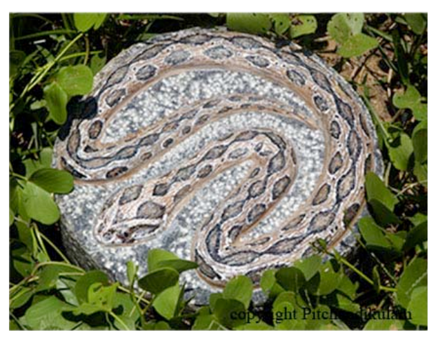
Image 9. A disused grinding stone carved and painted to represent a Russell's Viper Daboia russelli . Placed among herbage it has caused some consternation among the uninitiated. Pitchandikulam Forest, Auroville.