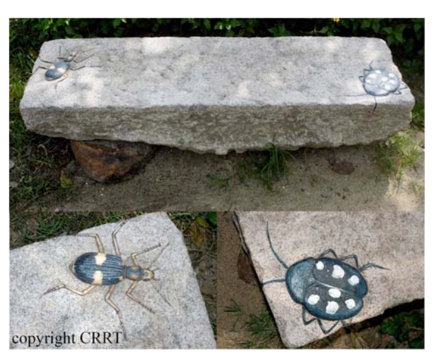
Image 10. An example of carved granite blocks used as benches. Species represented: Bombardier Beetle Macrocheilus niger and Domino Roach Therea petiveriana . Tholkappia Poonga, Chennai.