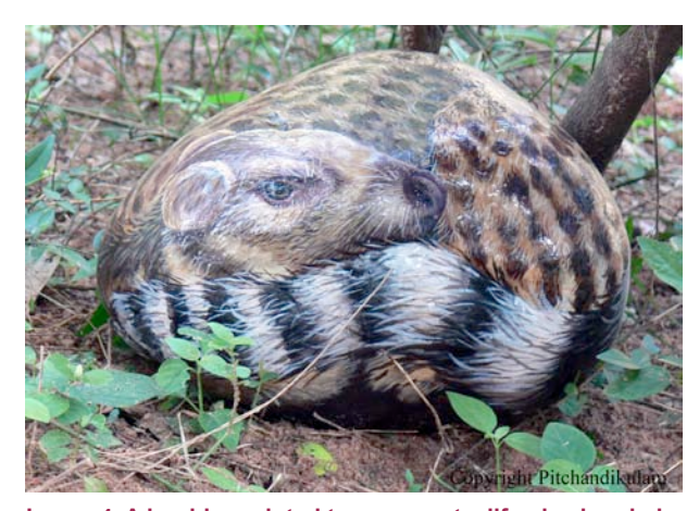
Image 4. A boulder painted to represent a life-sized curled up Small Indian Civet Viverricula indica . A photograph can do only 'so much' and the naturalness of this form has to be seen to be believed. Even seasoned wildlifers have been startled when confronted with this piece in its natural surroundings. Pitchandikulam Forest, Auroville.

unique way of seeing and sharing the world (<www.bbcwildlifemagazine.com/artist2009.esp>). Poster art, perforce being visually striking and designed to attract attention, was found to be one of the best tools for conservation education (Image 17). The genre of poster art produced was a combination of research poster and classroom poster as the need was to produce a simple 'one image' format that could sensitise people to the biotic wealth of the region as well as being scientifically accurate. Poster art from the time of Toulouse-Lautrec and Cheret had depended on colour, but black and white images were also used – for example, the poster publicizing the Exposition Universelle of 1905 at Liege. Both colour and black and white (ink) have been experimented with and the