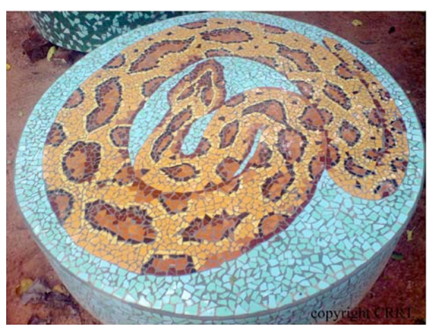
Image 15. Richness of colour is one feature of mosaic work that cannot be equaled by any other media. The cement ring which is used for seating is adorned by a Russell's Viper Daboia russelli . Tholkappia Poonga, Chennai.