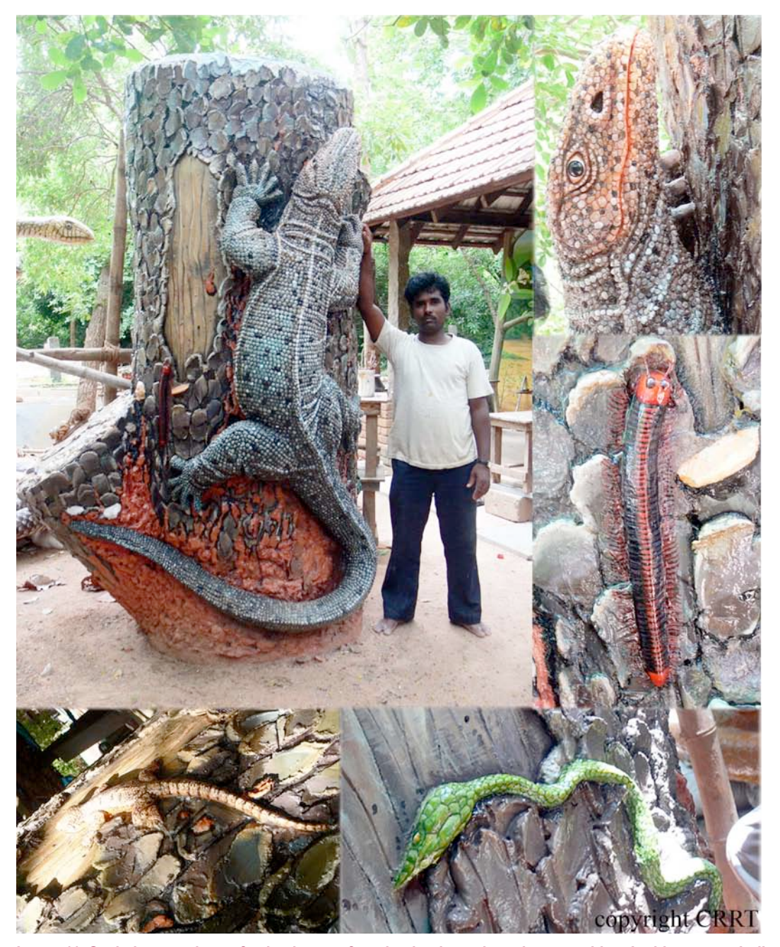
Image 11. Scaled up versions of animals were found to be dynamic and eye-catching. In this case an Indian Monitor Lizard Varanus bengalensis . In addition to the lizard, the tree trunk to which it clings also supports other faunal elements like the Green Vine Snake Ahaetulla nasutus , Brook's Gecko Hemidactylus brooki and Red-lined Millepede Xenobolus acaticonus in addition to others. Tholkappia Poonga, Chennai.