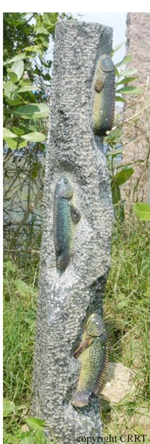
Image 6. Even life sized representations can be interesting – in this case three Climbing Perch Anabas testudineus. These fish were observed actually climbing up granite pillars of huts and walls at this particular site (the holotype was found in a palmyra tree). Tholkappia Poonga, Chennai.