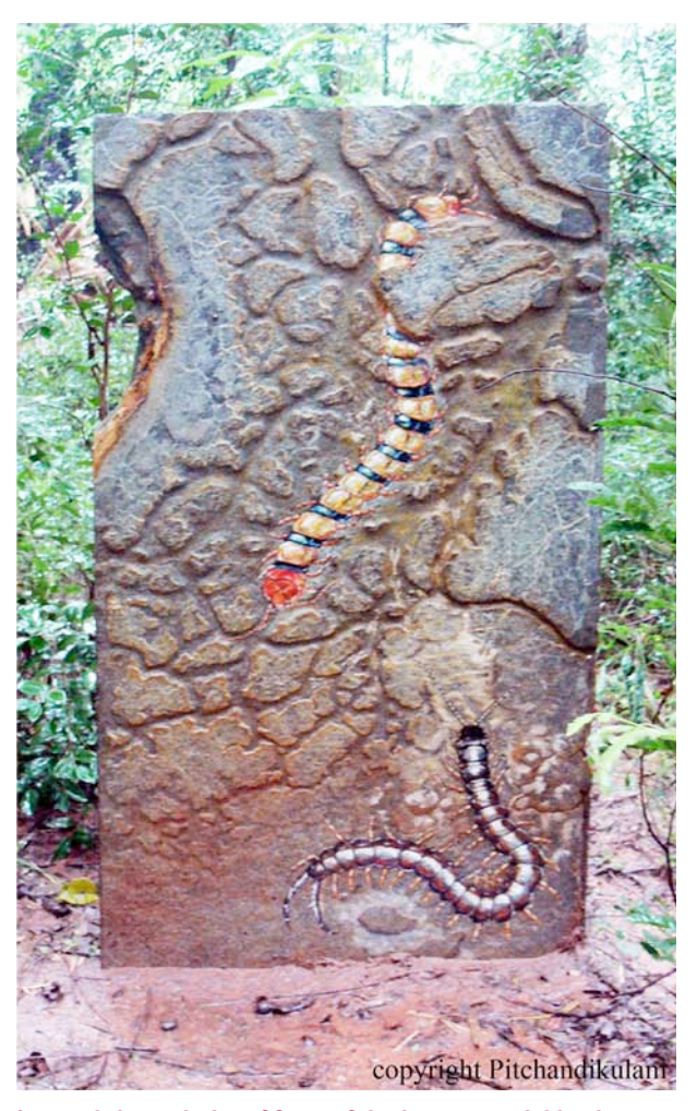
Image 2. Irregularity of form of the base material is always a challenge – in this case a 'broken' eroded stone slab like the last one, but with an even more irregular surface. The artist took the opportunity to represent a Centipede Scolopendra hardwickii seemingly moving under an overhang in its distinctive way. Pitchandikullam Forest, Auroville.

Mosaic: Wildlife art is a forum of imagery that will