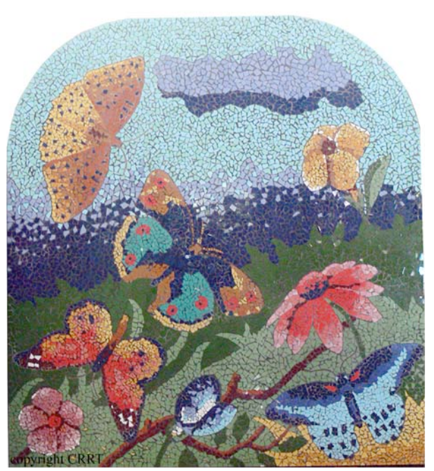
Image 14. Mosaic panel - one panel from a set of three depicting butterflies of the southern Coromandel Coast. Species represented: Common Leopard Phalanta phalantha , Blue Pansy Junonia orithya , Plain Tiger Danaus chrysippus and Blue Mormon Papilio polymnester . Tholkappia Poonga, Chennai.