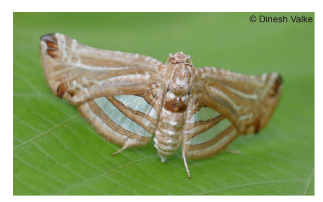
Image 1. Herdonia near thaiensis at Yeoor Hills, Sanjay Gandhi National Park, Maharashtra.

The present record represents a major extension