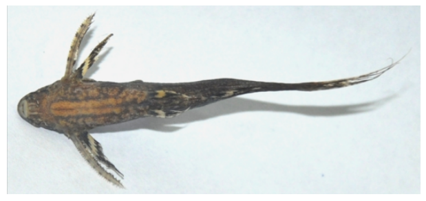
Image 1. Dorsal, lateral and ventral view of Conta pectinata , 42.5mm SL.

process and also equals the length of the supraoccipital spine. The length of the thoracic adhesive apparatus is almost equidistant between the pectoral and pelvic fin origins and also from the snout tip to the middle of the supraoccipital spine (Image 2). The position of the vent nearer the anal-fin origin (35.5–44.9 % PA-L). The body is deepest at dorsal-fin origin, deeper than wide; body depth at anus 10.3–11.9% SL, deeper than wide; length of dorsal-spine (15.7–20.8% SL); dorsal to adipose distance 30.4–32.7% SL and length of nasal barbel 8.1–11.0% HL.