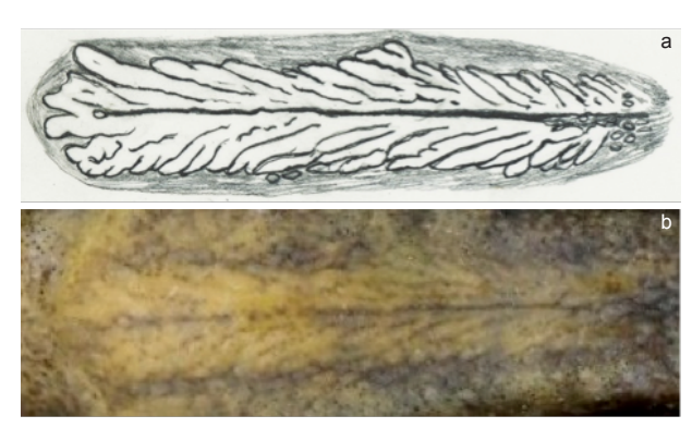
Image 2. Thoracic Adhesive apparatus of Conta pectinata , length: 13.3mm.

Specimens of Conta pectinata were collected from shallow (10–30 cm) and moderately clear water with pebbles, cobbles of variable colours and sand particles, at an altitude of 127m. Other species associated were: Aborichthys elongatus , Acanthocobitis botia , Amblyceps mangois , Barilius barna , B. bendelisis , Balitora brucei , Botia rostrata , Chanda nama , Crossocheilus latius , Garra annandalei , G. gotyla , Neolissochilus hexagonolepis , Pseudolaguvia shawi , Psilorhynchus balitora , Puntius ticto , Schistura savona and Tor tor .