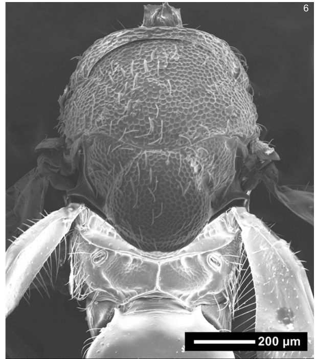
Images 1–7. 1 - Cyrtoptyx wayanadensis sp. nov., male body in profile; 2–7: Female: 2 - body in profile; 3 - antenna; 4 - antennal clava; 5 - Head in front view; 6 - Mesosoma in dorsal view; 7 - propodeum and metasoma dorsal view.