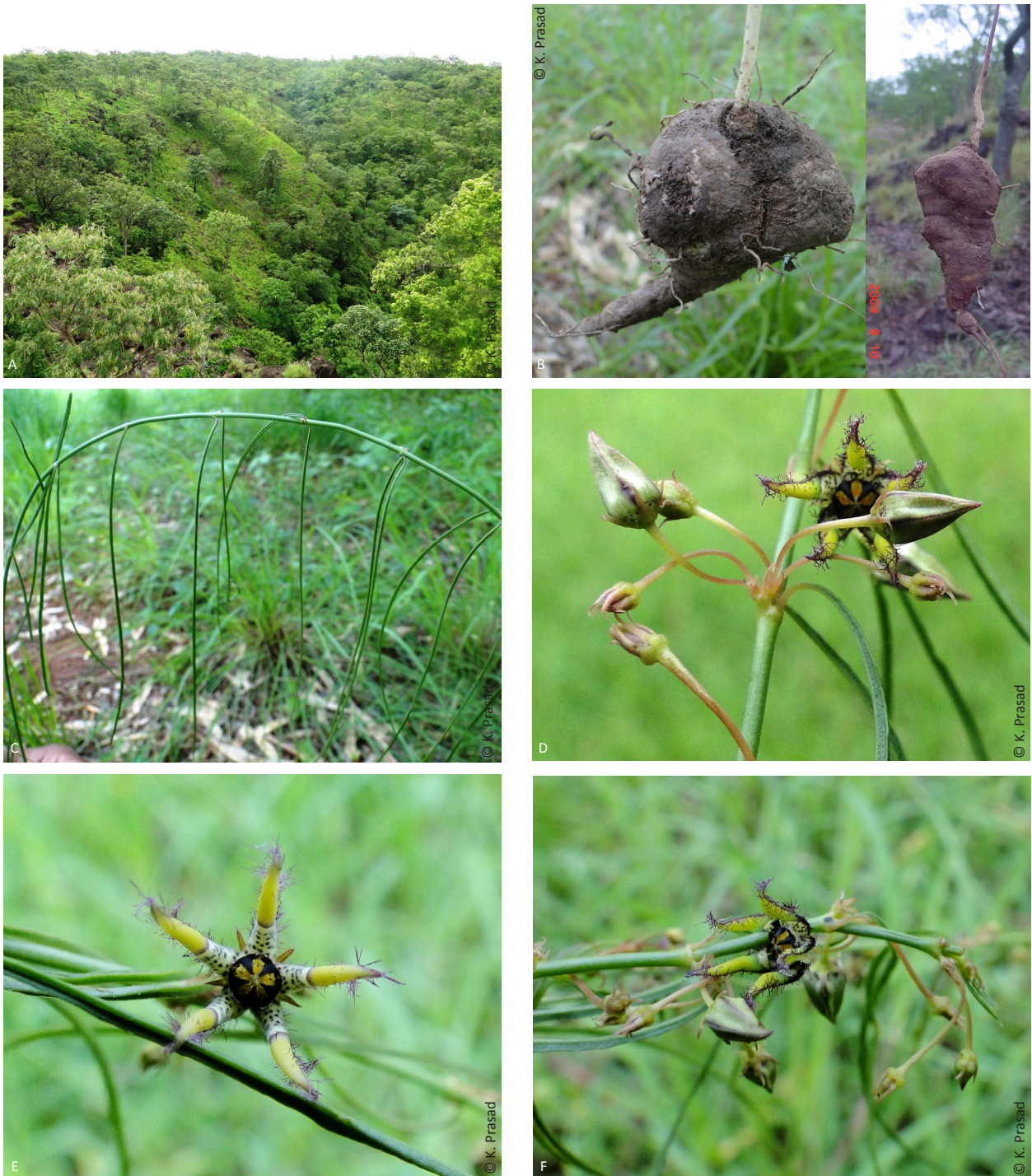
Image 1. Brachystelma nallamalayana sp. nov. A - habitat; B - tubers; C - leaves; D - inflorescence; E & F - flowers.

throughout, more dense at apex; lobes basally pale white with black spots and yellow above without any blotches. Corona ca. 3mm across, biseriate, glabrous; interstaminal corona obscurely 5-angled, cupular, forms a continuous ring around the gynostegium, brown; staminal corona 5-lobed, black; lobes appressed to