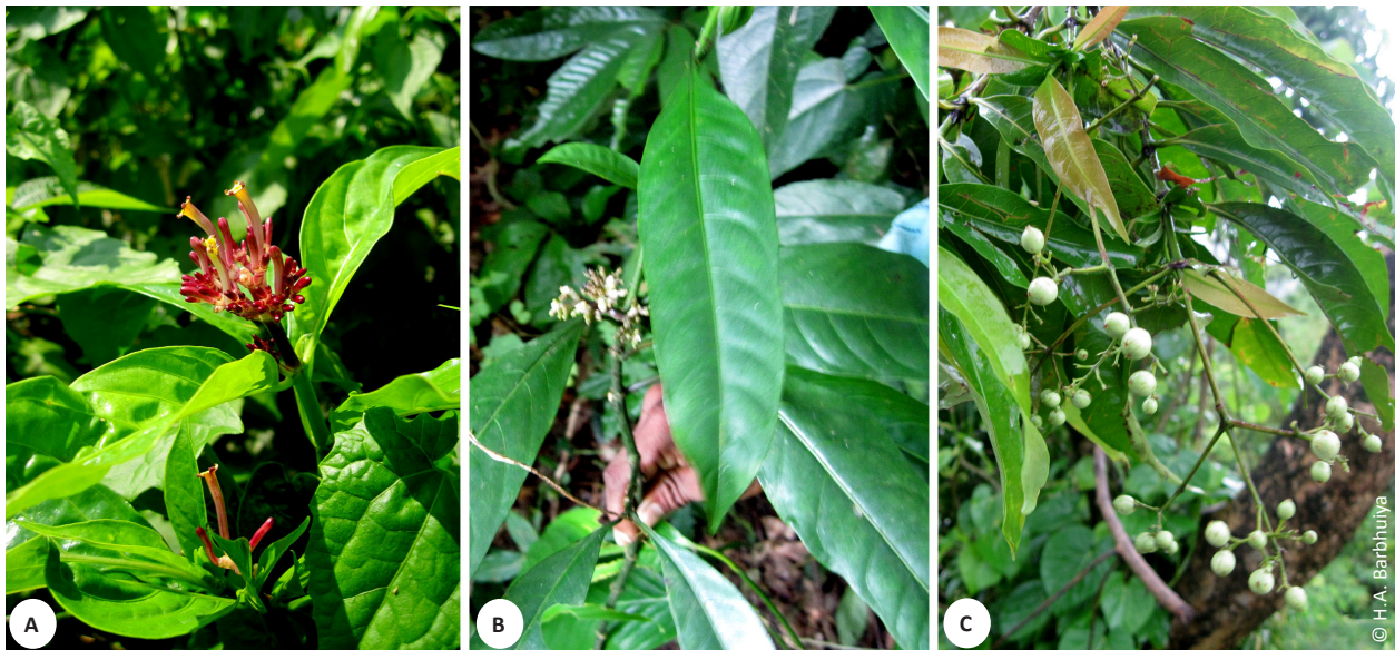
Image 2. A - Chassalia curviflora (Wall.) Thwaites var. ellipsoides Hook. f.; B - Chassalia staintonii (H.Hara) Deb & Mondal.; C - Ixora malabarica (Dennst.) Mabb.

Following IUCN Red List Categories and Criteria (IUCN 2001), the species has been classified as Endangered (EN). As there is no possibilities of rescue from neighboring regions, hence there is no change to the initial assessment.