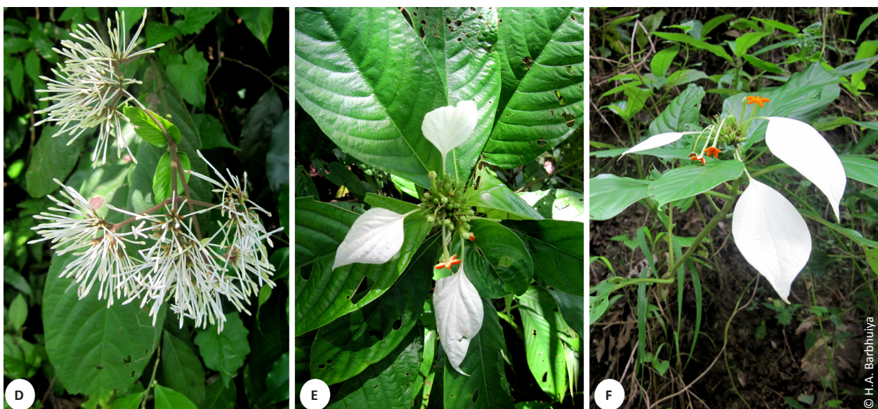
Image 2. D - Ixora rangonensis Bremek.; E - Mussaenda corymbosa Roxb.; F - Mussaenda keenanii Hook. f.