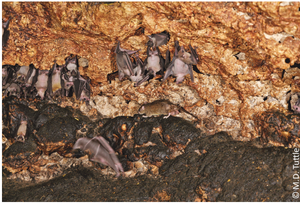
Image 2. Geoffroy's Rousette Fruit Bats Rousettus amplexicaudatus

Canon 5D digital camera and various lenses including a Canon 70–200 mm/F2.8 lens, a Canon 28–135 mm/F3.5–5.6 lens, and a Canon 28–70 mm lens from distances of up to 10m. Images were taken at non-random locations throughout the cave. The front of the cave was photographed on June 5, the middle of the cave on June 6, and the rear of the cave on June 8.