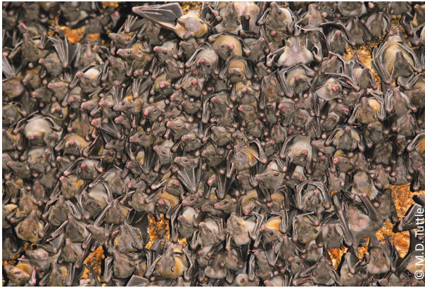
Image 4. Geoffroy's Rousette Fruit Bats Rousettus amplexicaudatus roosts in varied densities at the Monfort Bat Cave. The center of this image is an example of a higher density where the heads of the bats are mostly visible. Lower roost densities are visible at the periphery of the image where shoulders, and chests of bats, and portions of the cave wall are visible.

individual bats showing at least half of their bodies within the image; these data were independently verified by having multiple individuals sample each image and develop individual count data. In rare cases where we found discrepancies, we revisited images, determined the cause of the disparity and corrected accordingly until all analysts reached the same count. Generally, we selected 2–5 bats with heads oriented perpendicular to the image by which the post-orbital view was unobstructed. Because the sex and age of the bats could not be consistently identified, we applied the weighted average of the intra-orbital and post-orbital distances to all images in order to calculate the area represented within each image. We calculated an average roost density for the colony based on all 39 images used.