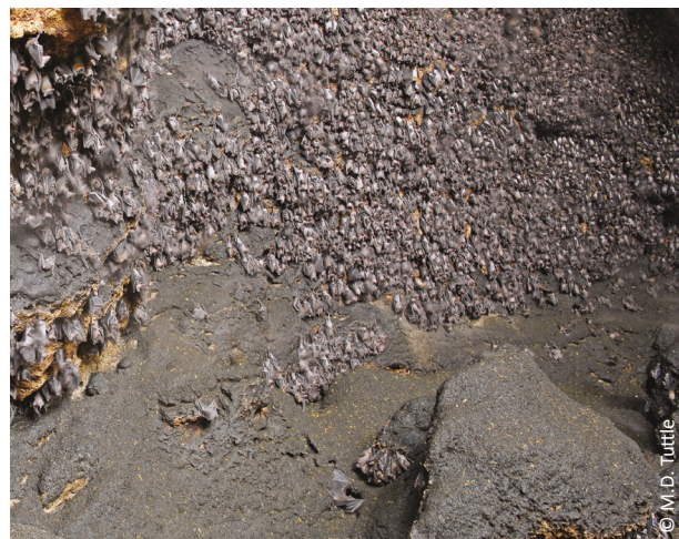
Image 1. Geoffroy's Rousette Fruit Bats Rousettus amplexicaudatus roost over much of the wall and even under rocks on the cave floor.

Field methods: A team of two entered the Monfort Bat Cave, either through the main horizontal entrance or the third vertical entrance from mid-morning to early afternoon on June 5, 6, and 8, 2006, to photographically document the colony, taking care to minimize disturbance. Although bats flew upon entry, most remained in the roost unless closely or quickly