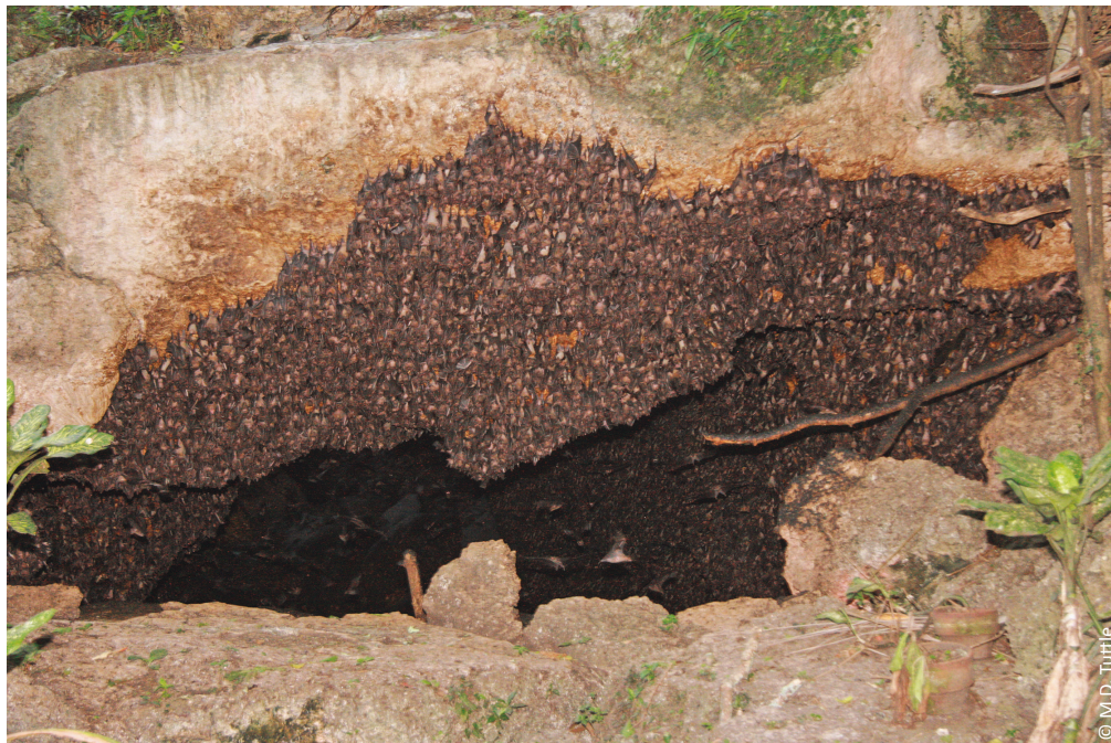
Image 3. Geoffroy's Rousette Fruit Bats Rousettus amplexicaudatus are protected at the Monfort Bat Cave and the competition for roost space is so great that the bats routinely roost outside the horizontal entrance in broad daylight.

Within each image, we marked and counted all