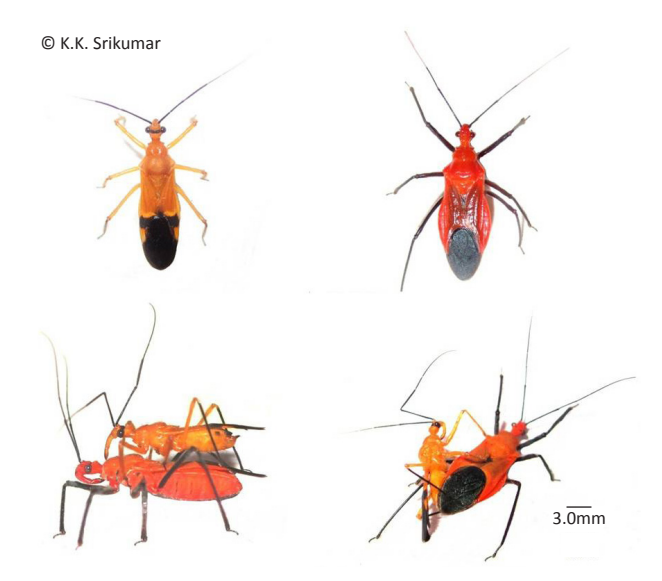
Image 3. C. gilvus : (a) male, (b) female, (c) riding over and (d) copulation

Mating behaviour: The sequential act of mating behaviour observed in C. gilvus as follows: