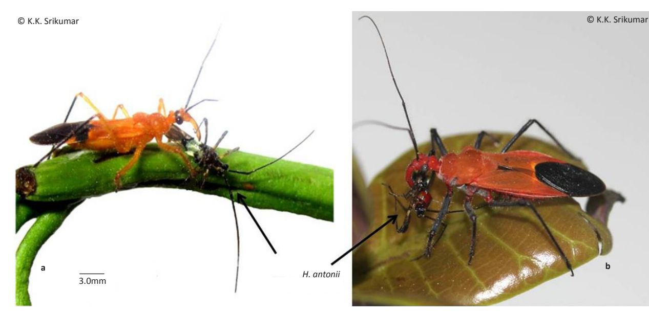
Image 4. C. gilvus: (a) male and (b) female predating on H. antonii

(208.3±3.9 eggs) (Sahayaraj & Sathiamoorthi 2002) and C. spiniscutis (173.72±11.67 eggs) (Claver & Reegan 2010).