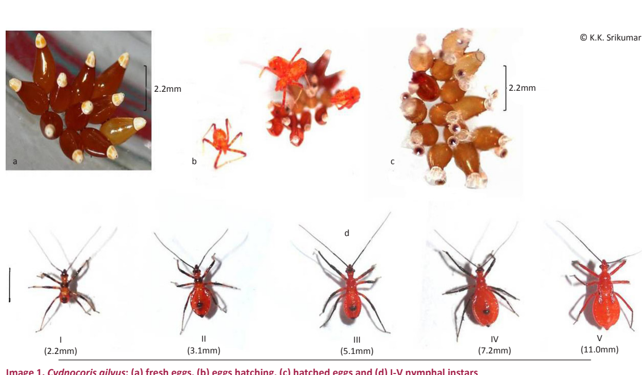
Ш ш IV (11.0mm) (3.1mm) (5.1mm) (7.2mm) Image 1. Cydnocoris gilvus: (a) fresh eggs, (b) eggs hatching, (c) hatched eggs and (d) I-V nymphal instars

The newly hatched nymphs were fragile and they became tanned in 3-4 hr after emergence and thereafter start feeding, showing preference to small and sluggish larvae. The developmental duration of I, II, III, IV and V instars were 9.50±1.45, 6.33±0.33, 4.50±0.62, 6.00±0.68 and 11.00±1.88 d, respectively (Table 2). Survival percentage of first instar was comparatively lower than