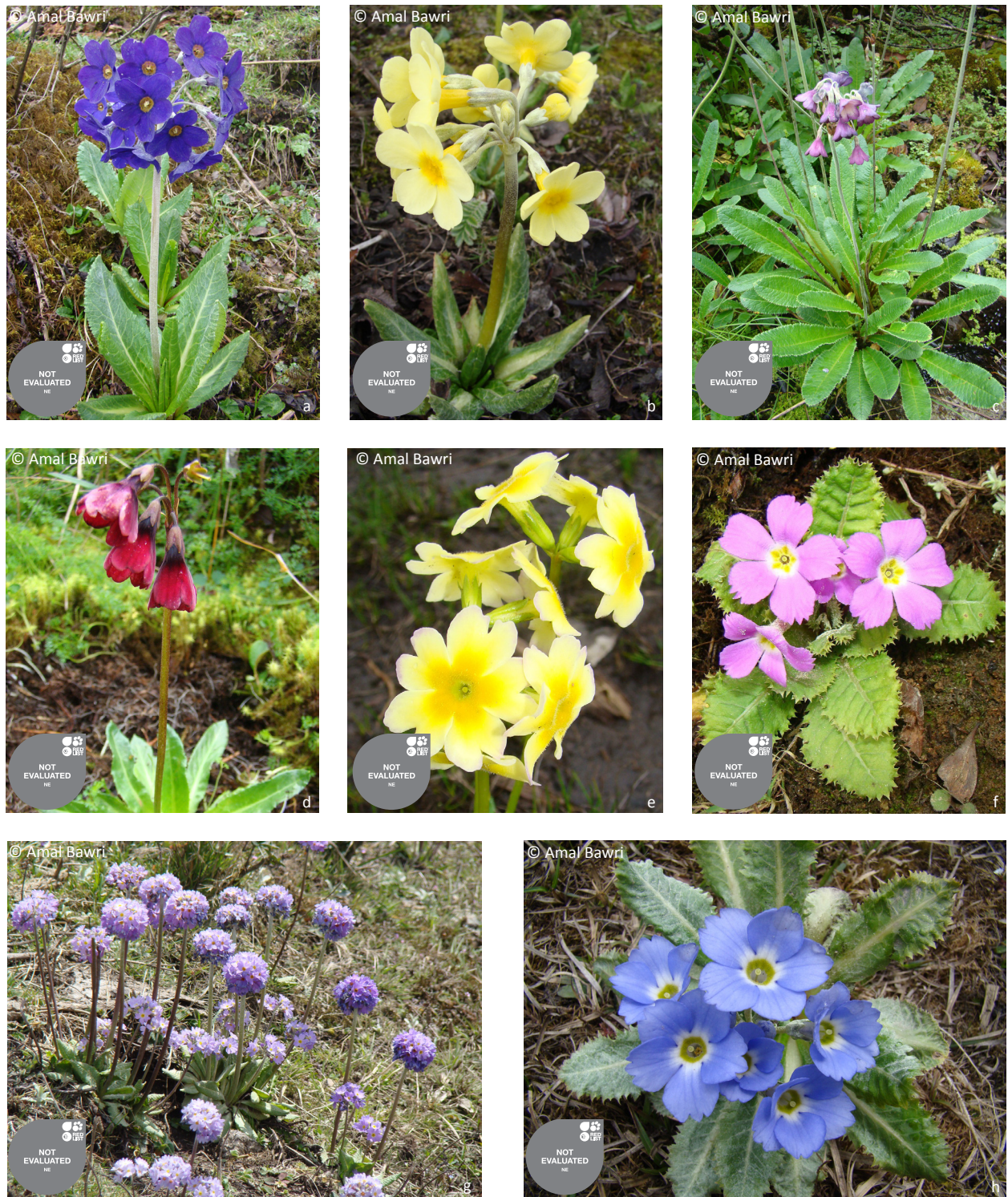
Image 1. Primula species in their natural habitat in Arunachal Pradesh. a - P. calderiana ssp. calderiana ; b - P. calderiana ssp. strumosa ; c - P. waltonii ; d - P. kingii ; e - P. dickieana ; f - P. gracilipes ; g - P. denticulata ; h - P. whitei .

was exhibited (28.92 individuals m -2 ) in Bomdila. In Maratha Ground it was (74.12 individuals m -2 ), while it was (50.72 individuals m -2 ) in PTSO study stand (Table 4).