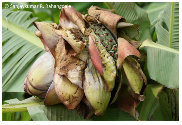
Image 3. Healthy flower and fruiting of Ensete superbum at nonharvesting site