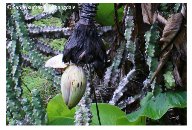
Image 2. Abortive flowering and fruiting of Ensete superbum at harvesting site

# Represents location considered as control. *, ** Represent significance at 5% (P= 0.05) and 1% (P=0.01) probability, respectively when compared with control location (Pangari).