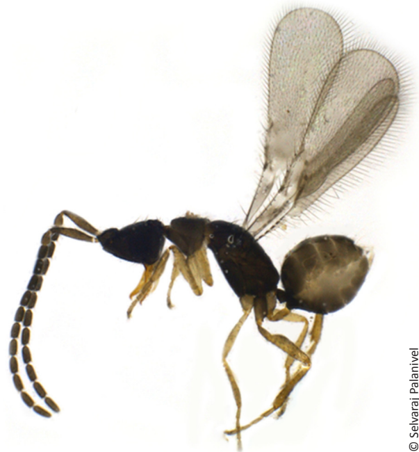
Image 1. Eubroncus scutatus sp. nov. - habitus image of female