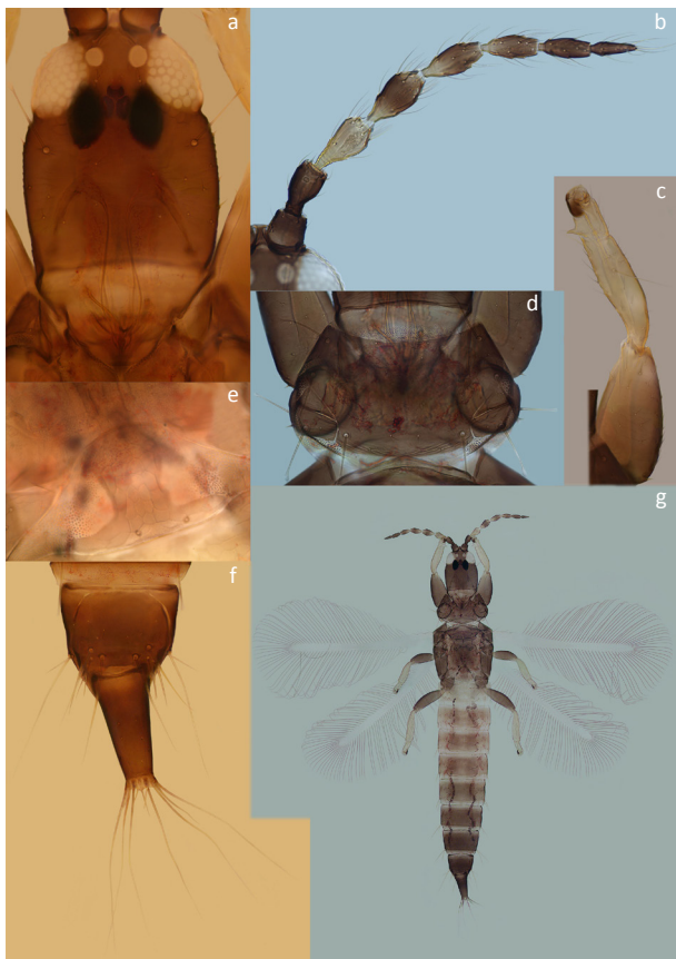
Image 10. Tylothrips samirseni sp. nov. a - Head; b - Antenna; c - Foreleg; d - Prothorax; e - Pelta; f - IX & X abdominal segments; g - whole mount.

the IX abdominal segment and terminal setae pointed; sides of the tube straight and gradually tapering towards the apex.