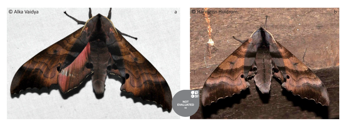
Image 1. Marumba irata photographed at (a) Khonoma, Kohima District, Nagaland and (b) Mao, Senapati District, Manipur.