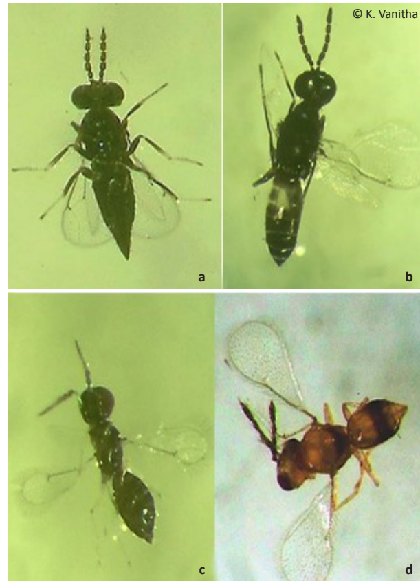
Image 2. Larval parasitoids of Cashew Leaf Miner. a - Chrysocharis sp. female; b - Chrysocharis sp. male; c - Closterocerus sp.; d - Aprostocetus sp.

Among the larval instars of cashew leaf miner, the third and fourth instar larvae were generally parasitized. For many parasitoids, preference for different stages of hosts for parasitization was reported (DeBach 1943; Bartlett 1964). Parasitism at the third instar stage may be economically important from the pest management point of view, since in cashew, a large portion of the damage and reduction of leaf area was found to be caused by the third instar leaf miner larva (Jacob &