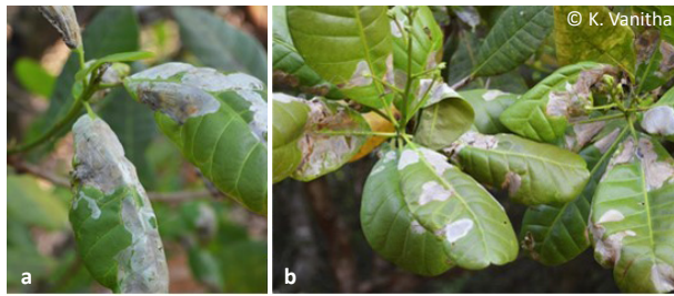
Image 1. Leaf miner infestation during a - flushing stage, b - flowering stage

flushing periods of differently aged cashew varieties and variable overlapping populations of leaf miner larvae, parasitism continued for a longer period, even up to five months under field conditions. Furthermore, adult parasitoids of Chrysocharis sp. could successfully emerge from the pupae from the leaf mines collected even from the insecticides (lambda cyhalothrin) sprayed plots, indicating that there was no detrimental effect of lambda cyhalothrin on this parasitoid during the pupal stage, and thus Chrysocharis sp. population could remain in the system even during occasions of insecticidal spray on cashew.