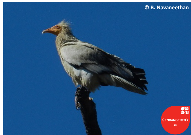
Image 3. Egyptian Vulture Neophron percnopterus