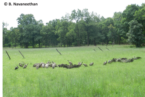
Image 4. Long-billed Vulture flock