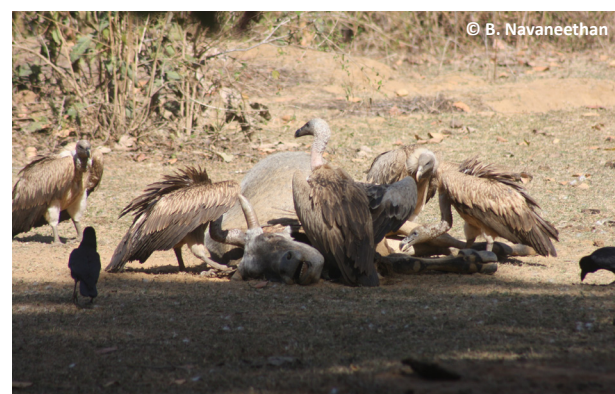
Image 5. Long-billed Vultures feeding on carcass