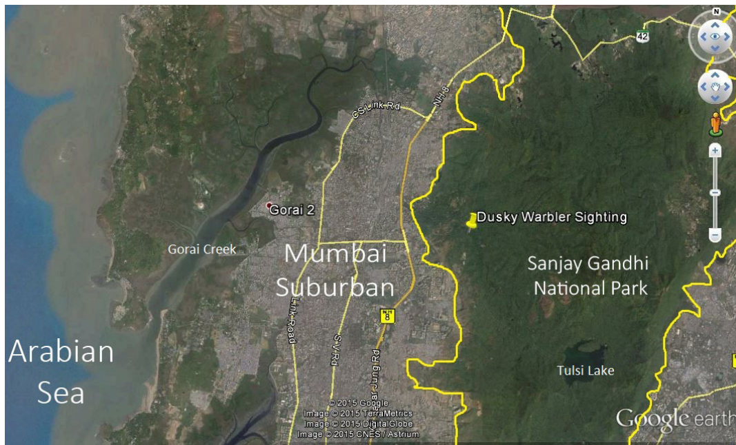
Figure 1. Map of the Sanjay Gandhi National Park, Mumbai, India showing the sighting location of Dusky Warbler Phylloscopus fuscatus .