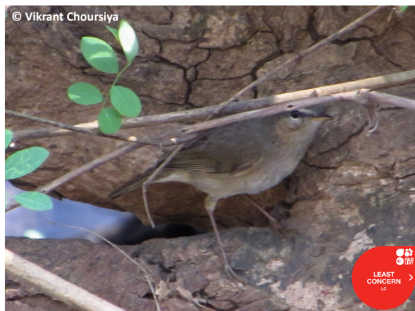
Image 1. An individual Dusky Warbler Phylloscopus fuscatus photographed on 15 December 2013 in Sanjay Gandhi National Park, Mumbai, Maharashtra, India.

with evergreen riverine forest mainly of composed of Millettia pinnata and Dendrocalamus sp. on the either banks. The individuals were observed to frequent branches and foliage of all the above plant species.