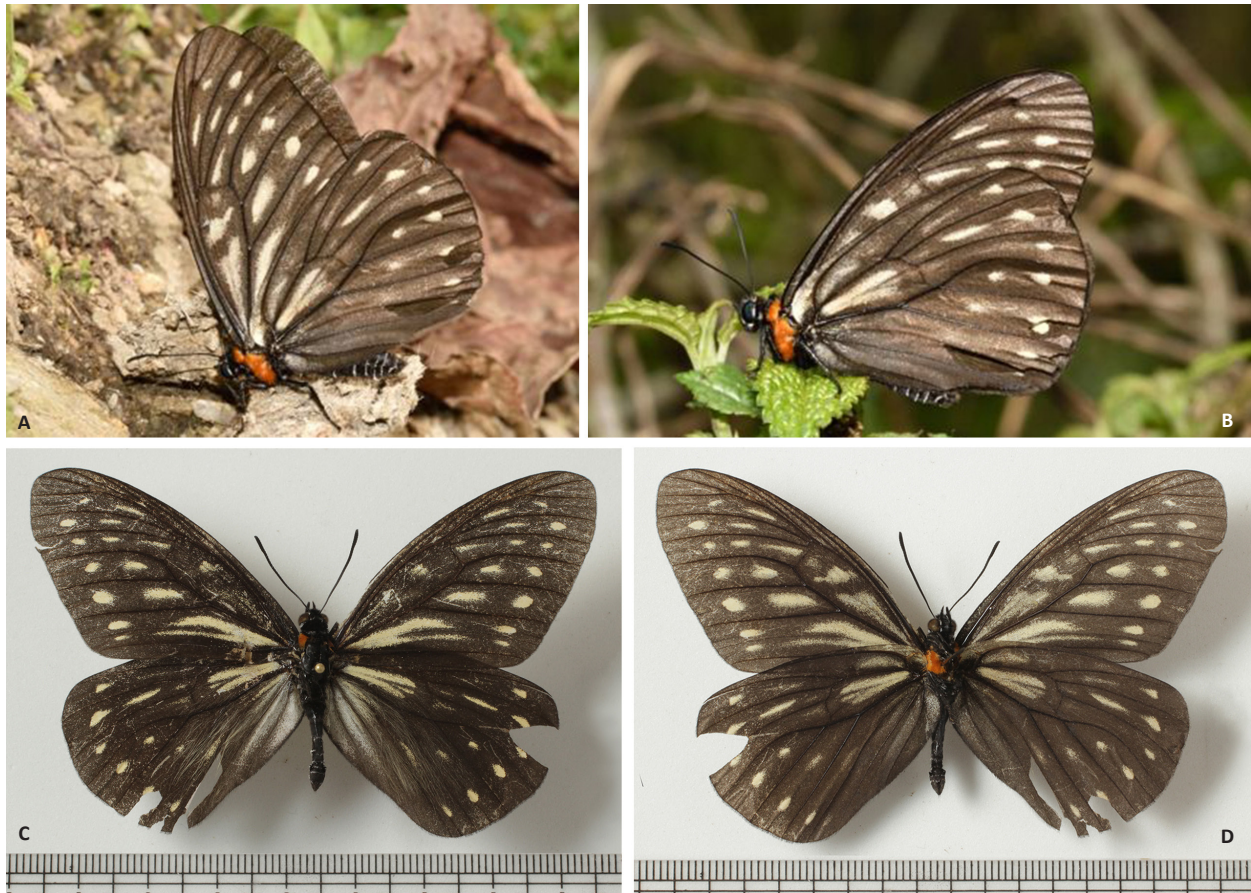
Image 2. Calinaga aborica recorded near Sochung, Pakke Kesang, East Kameng District, Arunachal Pradesh, India. 21 May 2015. A millimeter scale is at the bottom of C–D.