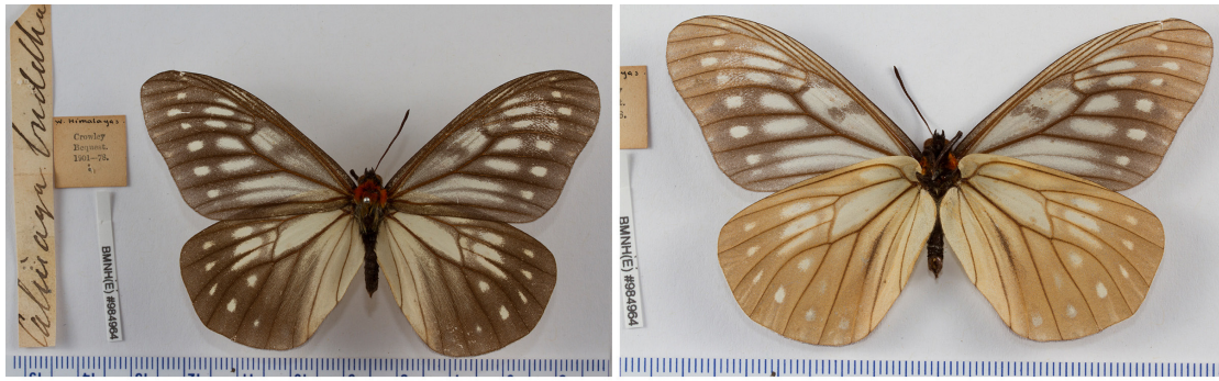
Calinaga buddha Moore, 1857 (♂. "W. Himalayas", N. India. Date and collector unknown. BMNH(E)#984964)