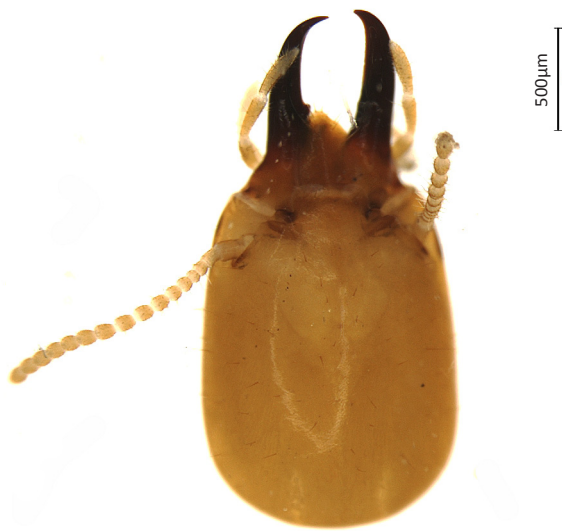
Image 6. Mandible and head structure of Odontotermes horai Roonwal & Chhotani