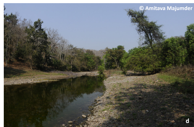
Image 1. Different habitats where termites collected