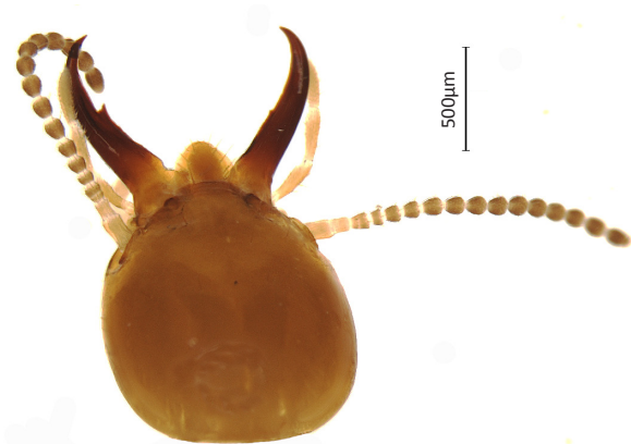
Image 5. Mandible and head structure of Odontotermes gurdaspurensis Holmgren & Holmgren

Material examined: 4159/H11. 16.ix.2012. Surguja District, Tara, Gaddaghat, 1 vial with sev. S. and W., coll. A. Raha & Party, Ex. from mound; (ii) Reg. No.: 4160/H11, 4161/H11. 11.v.2013, Koriya District, GGNP, Behrapani, 2 vials with sev. S. W., Reg. No.: 4162/H11, 4163/H11, 4164/H11, 12.v.2013, Khirki Beat, 3 vials with sev. S. and W., coll. A. Raha & Party, Ex. from cow dung and soil under the stone.