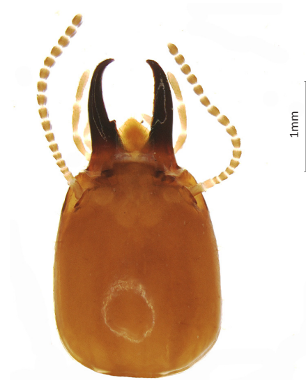
Image 7. Mandible and head structure of Odontotermes horni (Wasmann)