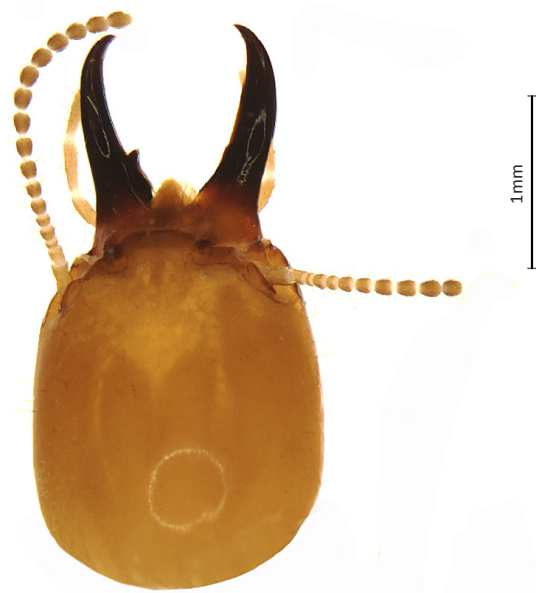
Image 3. Mandible and head structure of Odontotermes feae (Wasmann)

Distribution: India: Chhattisgarh (Surguja), Assam, Bihar, Gujarat, Jammu & Kashmir, Karnataka, Kerala, Madhya Pradesh, Maharashtra, Manipur, Odisha, Punjab, Tamil Nadu, West Bengal, Uttar Pradesh; Bangladesh, Pakistan.