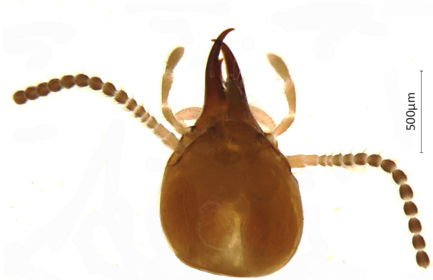
Image 4. Mandible and head structure of Odontotermes globicola (Wasmann)