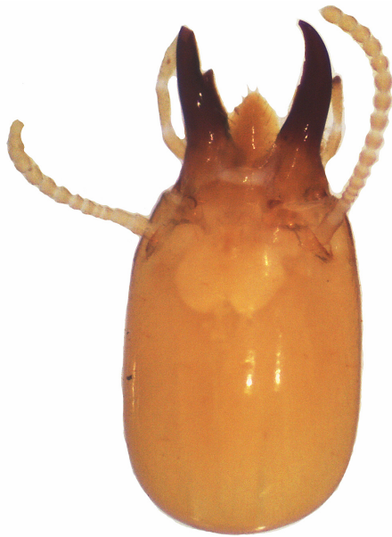
Image 2. Mandible and head structure of Odontotermes assmuthi (Wasmann)