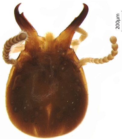
Image 8. Mandible and head structure of Odontotermes latiguloides Roonwal & Verma