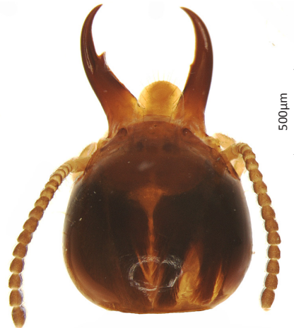
Image 9. Mandible and head structure of Odontotermes obesus (Rambur).

17 segments. Mandibles strong, stout, saber-shaped (length 1.27–1.60 mm; tooth index mandible length/head length 0.53–0.66), left mandible with a large tooth near the base of middle third (tooth distance 0.70–1.00 mm, index: tooth distance/mandible length 0.57–0.64). Postmentum subrectangular (length 1.50–2.00 mm, max width 0.75–0.93 mm). Pronotum length 0.80–1.03 mm, width 1.40–1.80 mm