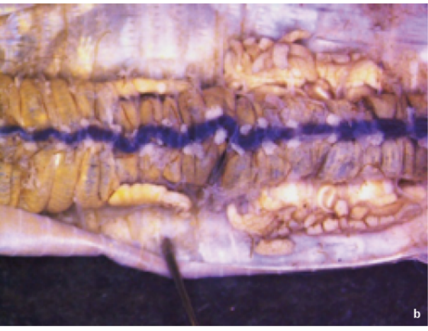
Image 2. Metaphire peguana : a - Clitellar region - clitellum, male pores and GM glands; b - Prostates and caeca

from anterior face of duct at parietes, longer than main axis, with slender stalk, longer and thicker mid-portion irregularly looped, terminal seminal chamber spheroidal to ovoidal. GM glands, nearly spheroidal, with thick muscular wall and small lumen, slightly protuberant into coelom.