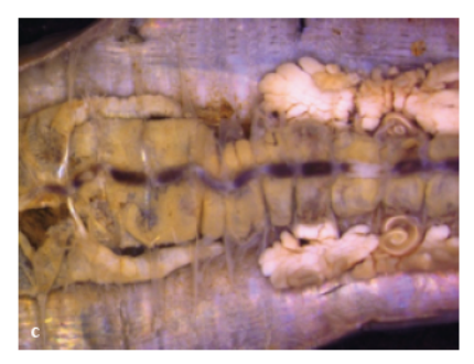
Image 1. Amynthas alexandri: a - Clitellar region - clitellum, female and male pores; b - Gizzard and sprematheca; c - Prostates and caeca

Devi Estate Pettickal (Attappady), Thazhesambarkode (Attappady) in Palakkad District), Andaman and Nicobar Islands, Assam, Tripura, Himachal Pradesh, Madhya Pradesh, Maharashtra, Punjab, Tamil Nadu, Uttarakhand, Uttar Pradesh, West Bengal; China, Indonesia, Malaysia, Myanmar, Singapore, Thailand and Vietnam.