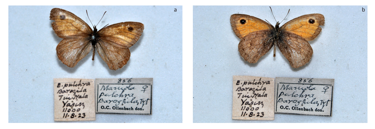
Image 18 a,b. Dusky Meadowbrown Hyponephele baroghila (Tytler, 1926) (female: 41mm) – 11 August 1923; TuiNala, Yasin, Gilgit; 3,353m (NFIC-FRI-11150). a - dorsal view; b - ventral view