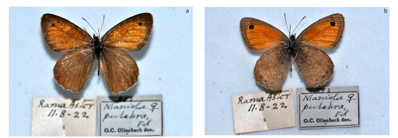
Image 14 a,b. Dusky Meadowbrown Hyonephele pulchra (Felder & Felder [1867]) (female: 40mm) – 11 August 1922; Rama, Astor (Kashmir) (NFIC-FRI-11139). a - male-dorsal view; b - male-ventral view