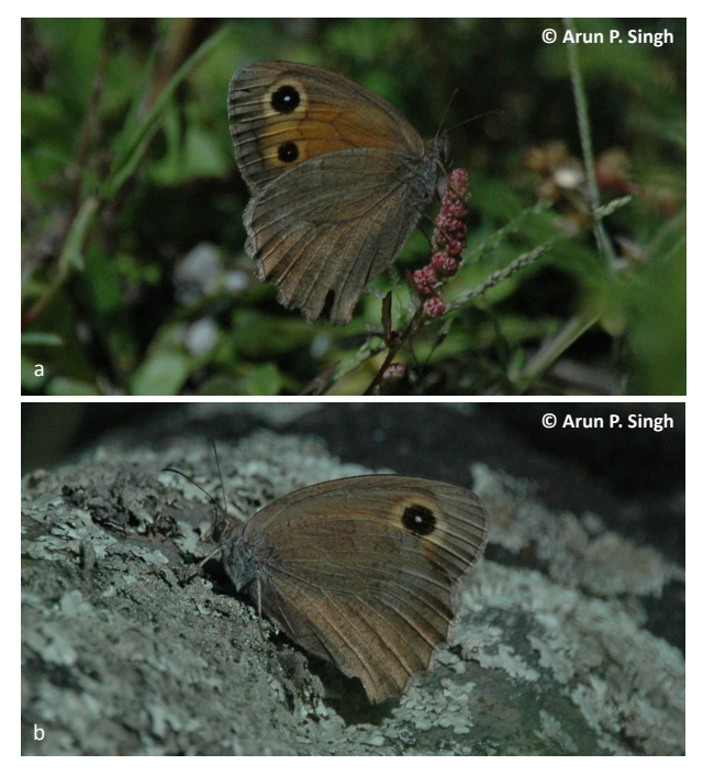
Images 1 & 2 - Oriental Meadowbrown Hyponephele cheena (14 September 2008; Holi, Chamba District, Himachal Pradesh). a - dorsal view; b - ventral view