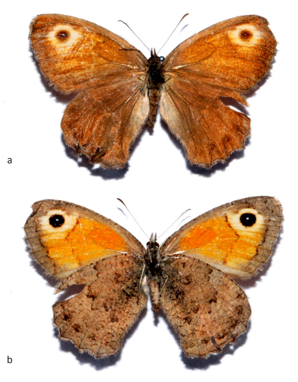
Image 10 a,b. Tawny Meadowbrown Hyponephele pulchella (Felder & Felder [1867]) (female: 45mm) - 05 August 2009, Gulmarg, Kashmir. a - female-dorsal view; b - female-ventral view (NFIC-FRI-7654).