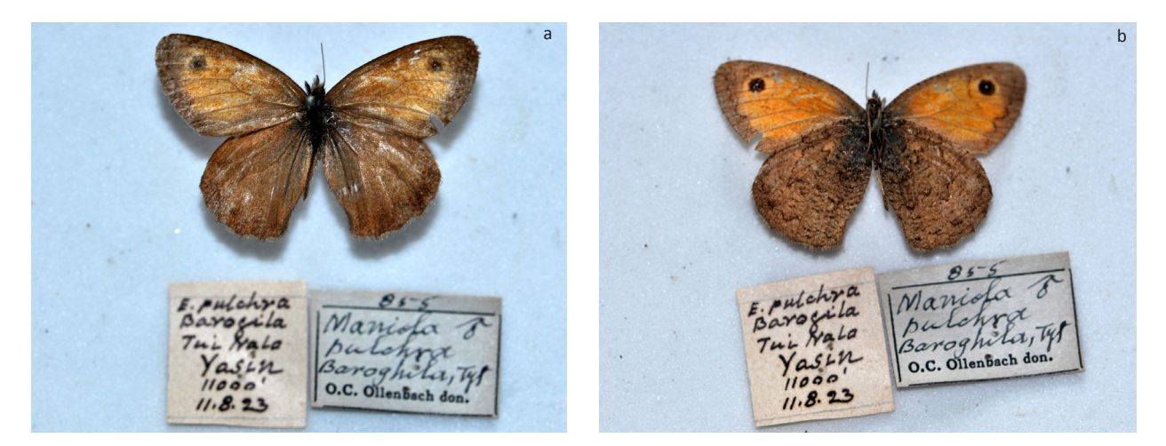
Image 17 a,b. Dusky Meadowbrown Hyponephele baroghila (Tytler, 1926) (female: 40mm) – 11 August 1923; TuiNala, Yasin, Gilgit; 3,353m (NFIC-FRI-11150). a - female-dorsal view; b - female-ventral view