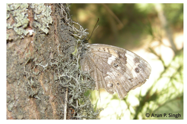
Image 6. Yellow Wall Kirinia eversmanni cashmierensis perched on a deodar, Cedrus deodara (Roxb.) G. Don in Handwara, Kashmir; 4 August 2009.

satyrids, the study suggests the need to carry out more field surveys for collecting and documenting individuals of this genus from the higher reaches of the northwestern Himalaya in order to correctly ascertain their distribution and the taxonomic status of different taxa using molecular analysis / dissecting the genitalia of fresh specimens for morphometric analysis for comparison with congeners.