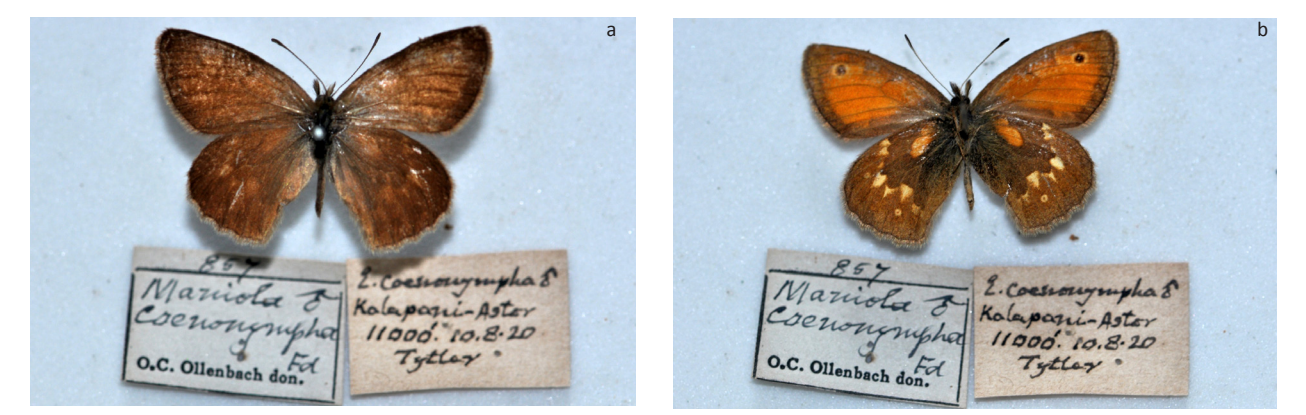
Image 20 a,b. Spotted Meadowbrown Hyponephele coenonympha (Felder& Felder, [1867]) (male: 40mm) – 10 August 1920; Kalapani, Astor (Kashmir); 3,353m ( (NFIC-FRI-11140). a - female-dorsal view; b - female-ventral view