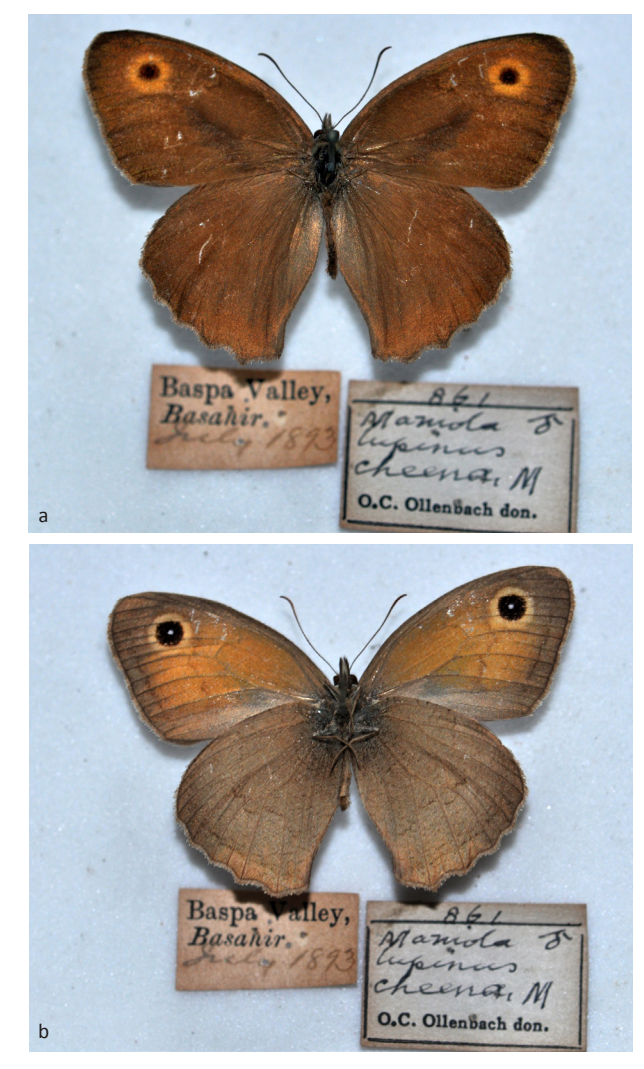
Image 5 a,b. Oriental Meadowbrown Hyponephele cheena (male: 50mm) - July 1873; Baspa Valley, Basahir (Rampur, Kinnaur, Himachal Pradesh) (NFIC-FRI-7653).