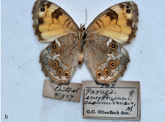
Image 8 a,b. Yellow Wall Kirinia eversmanni cashmierensis (female: 42mm) - Chitral; 4 August 1917 (NFIC-FRI-11132).