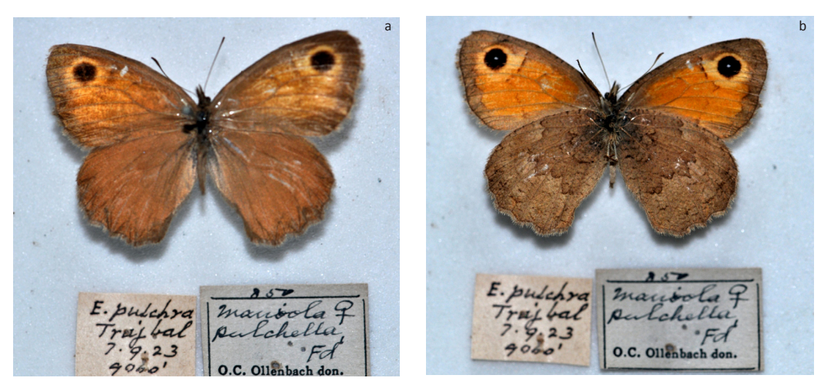
Image 11 a,b. Tawny Meadowbrown Hyonephele pulchella (Felder & Felder [1867]) (female: 45mm) - 07 September 1923; 2,761m; Trujbal (Kashmir) ( (NFIC-FRI-7654)). a - male-dorsal view; b - male-ventral view