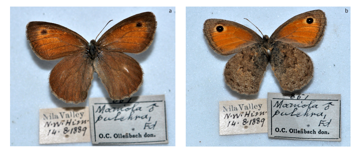
Image 13 a,b. Dusky Meadowbrown Hyonephele pulchra (Felder & Felder [1867]) (male: 40mm) - 14 August 1889; Nila Valley (Garhwal), northwestern Himalaya (NFIC-FRI-11139). a - female-dorsal view; b - female-ventral view