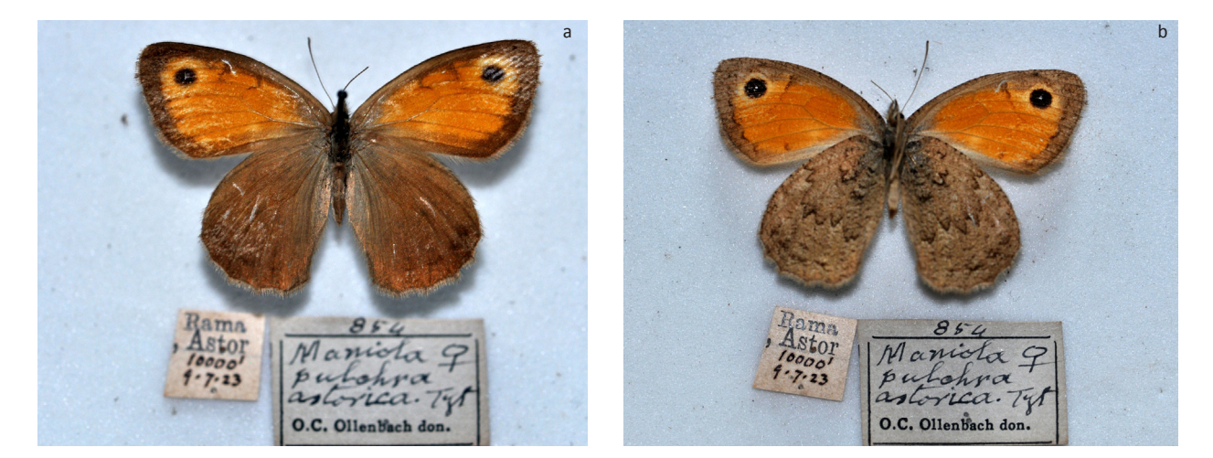
Image 16 a.b. Dusky Meadowbrown Hyponephele astorica (Tytler, 1926) (female: 45mm) - 04 July 1923; 3,048m; Rama, Astor (Kashmir) (NFIC-FRI-11149). a - male-dorsal view; b - male-ventral view