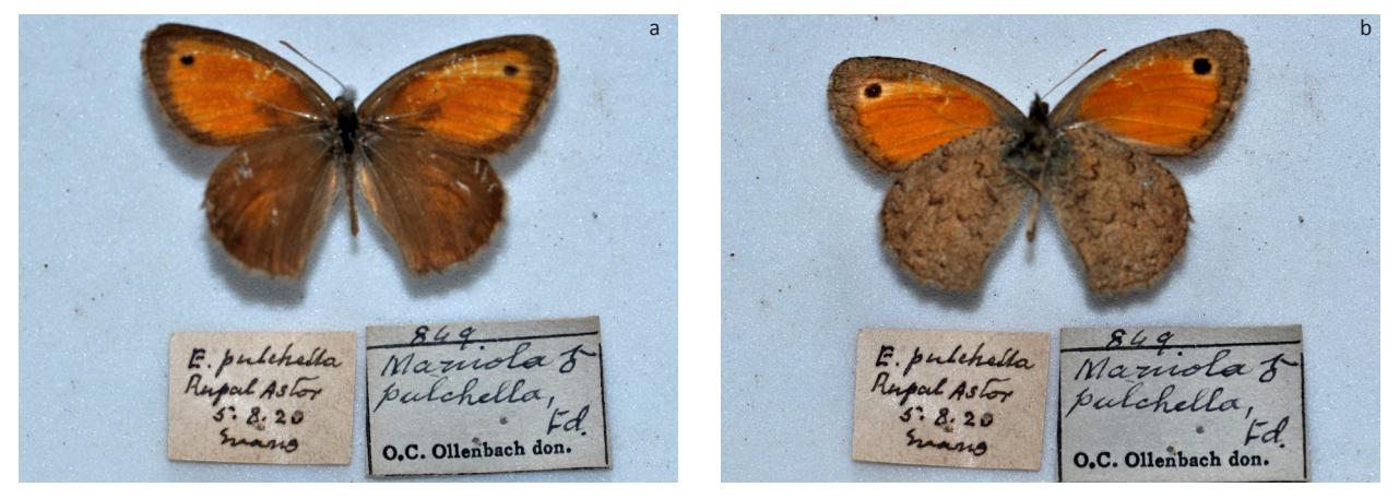
Image 12 a,b. Tawny Meadowbrown Hyponephele pulchella (Felder & Felder [ 1867]) (male: 44mm) - 04 April 1920; Rupal, Astor (Kashmir) (NFIC-FRI-7654). a - male-dorsal view; b - male-ventral view