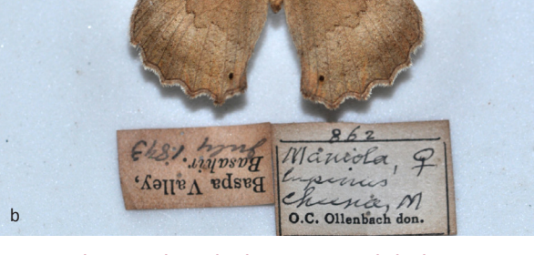
Image 4 a,b. Oriental Meadowbrown Hyponephele cheena (female: 55mm) - July 1873; Baspa Valley, Basahir (Rampur, Kinnaur, Himachal Pradesh) (NFIC-FRI-7653). a - male, dorsal view; b - male, ventral view