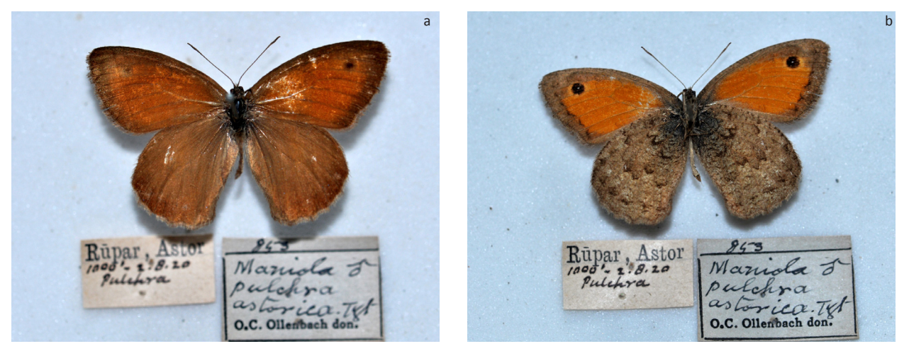
Image 15 a,b. Dusky Meadowbrown Hyponephele astorica (Tytler, 1926) (male: 43mm) - 02 August 1920; 307m; Rupar, Astor (Kashmir) (NFIC-FRI-11149). a - female-dorsal view; b - female-ventral view