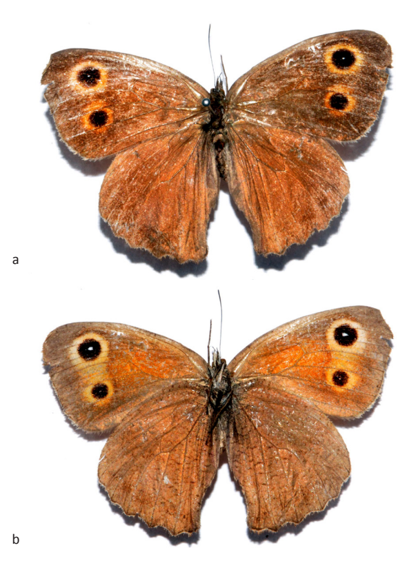
Image 3 a,b. Oriental Meadowbrown Hyponephele cheena (female: 45mm) - 13 September 2008; Holi, Chamba District, Himachal Pradesh [ (National Forest Insect Collection at Forest Research Institute, Dehradun, India (NFIC-FRI-7653)]. a - dorsal view; b - ventral view

to Kashmir (Evans 1932) and also found in Pakistan and Afghanistan between 1,800–2,700 m in open grassy hillsides and terraced fields (Kehimkar 2008). Recorded from Jammu & Kashmir in Pahalgam, Anantnag District on 27 July 2013 (by Rohan Lovalekar & Nikhil Chaudhari) & Gurais Valley, Bandipore District on 04 August 2007 by Vidya Venkatesh (http://www.ifoundbutterflies.org/ sp/2681/Kirinia-eversmanni). Specimens of this subspecies from Chitral [Female: 42mm; 07 August 1917 (Image 8 a,b); male: 17 June 1910 at 2400m] collected by O.C. Ollenbach are kept in NFIC. This taxon is listed in Schedule II, Part II of the Indian Wildlife (Protection) Act, 1972.