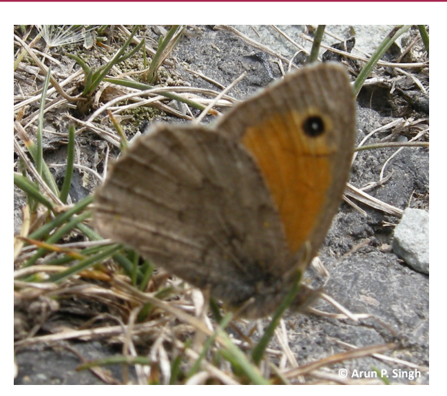
Image 9. Tawny Meadowbrown Hyponephele pulchella (Felder & Felder [1867]) (male) in Gulmarg, Kashmir (5 August 2009)