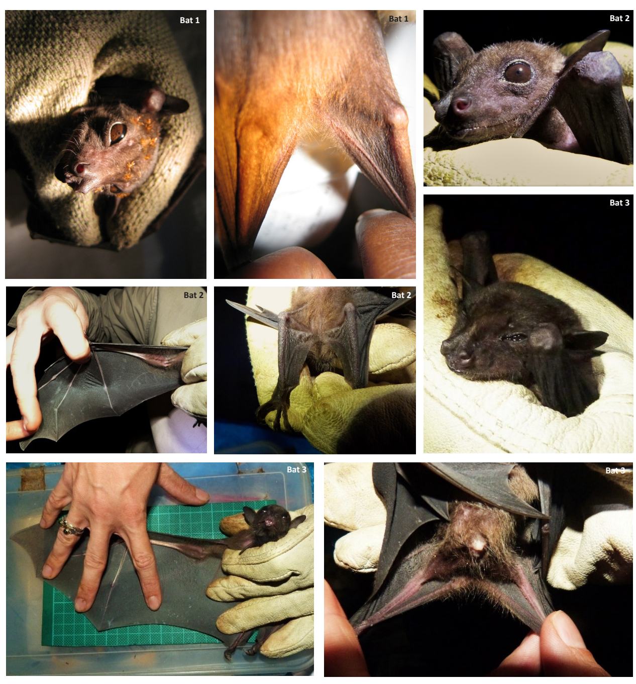
Image 1. Photographs of all three bats caught. Note the lack of external tail.

Harrison Zoological Museum Publications, 258pp.