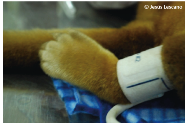
Image 1. Vital signs monitoring in an immobilized Kinkajou ( Potos flavus ). Note (a) pulsioximeter probe placed in the tongue and (b) pressure cuff placed on hindlimb

A rating of “Good” was given when no adverse effect was observed, a “Satisfactory” rating was given when adverse effects were observed during a maximum of five minutes, and an “Unsatisfactory” rating was given when adverse effects lasted more than five minutes. Quality ratings were also represented by a number scale (1=good, 2=satisfactory and 3=unsatisfactory) (Bakker et al. 2013).