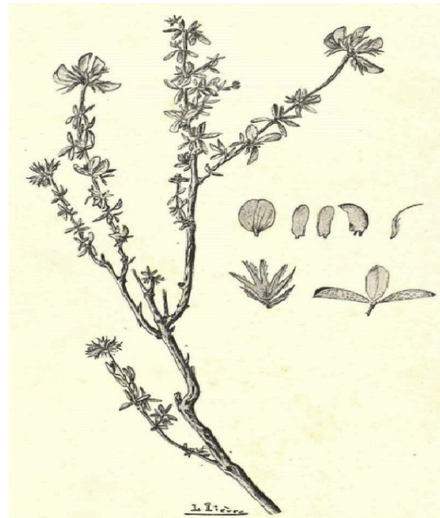
Figure 1. Illustration of the specimen of Adenocarpus faurei (in Maire 1921) from Tiaret, Algeria.