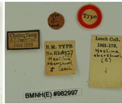
Image 4. Limenitis mimica (Poujade, 1885) (specimen shown is the male holotype of oberthuri Leech,1890) #982997 (left dorsal, right ventral) ChangYang, China, June 1888.