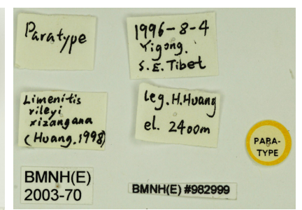
Image 3. Limenitis rileyi xizangana (Huang, 1998) male paratype #982999 (left dorsal, right ventral) Yigong southeastern Tibet, 2,400m, 4th Aug 1996