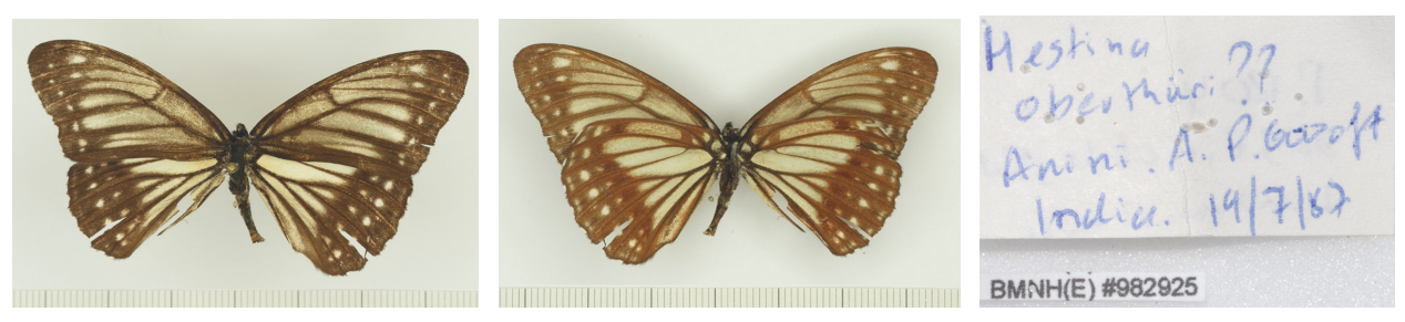
Image 1. Limenitis rileyi (Tytler, 1940) male #982925 (left dorsal, right ventral) Dri Valley, Upper Dibang Valley, Arunachal Pradesh, c.1,830m, 19th July 1987