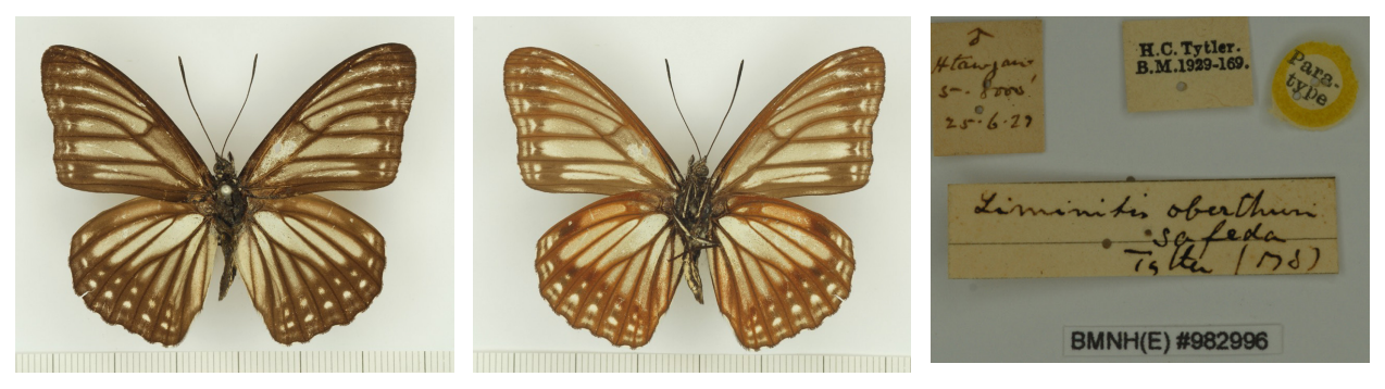
Image 2. Limenitis rileyi rileyi (Tytler, 1940) male paratype #982996 (left dorsal, right ventral) Htawgaw northeastern Myanmar, 1,500–2,400m, 25th June 1929