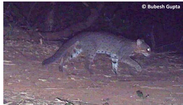
Image 1. Rusty-spotted Cat Prionailurus rubiginosus captured by camera trap on 10 August 2016

Another interesting feature is that P. rubiginosus shares its habitat with Felis chaus and in future it would be interesting to investigate niche patterns of the two felids. Though both species are nocturnal, P. rubiginosus seems to be more arboreal in habits (Nowell & Jackson 1996) and is probably the reason camera traps recorded it only once. Another factor may be that the two species prey on different food sources. Though the diet of P.