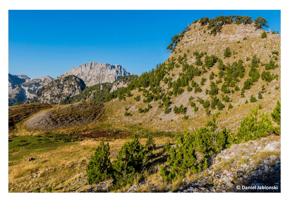
Image 1. An overview on the subalpine habitat of the species near Qafe e Terthores, Prokletije Mountains. Albania.

The trapping site was in the southwestern part of the Albanian Prokletije Mountains near Qafe e Terthores (42.390 N & 19.726 E; 1,626m; coordinates and elevations acquired using a Garmin 60CSx Global Positioning System unit and referenced to map datum WGS84). The newly discovered population of D. bogdanovi is located (airline distances) 32km from the nearest locality of the species in Montenegro and 62km from the locality in Kosovo (Kryštufek et al. 2007; Kryštufek & Bužan 2008). The habitat represents subalpine/alpine grassland and sparse pine forest ( Pinus heldreichii Christ, 1863) deposited on limestone, consisting of medium size rocks (>30cm in diameter). The trapping point was located on a steep slope with south orientation (Image 1). The specimen's body measurements were: weight 52g;