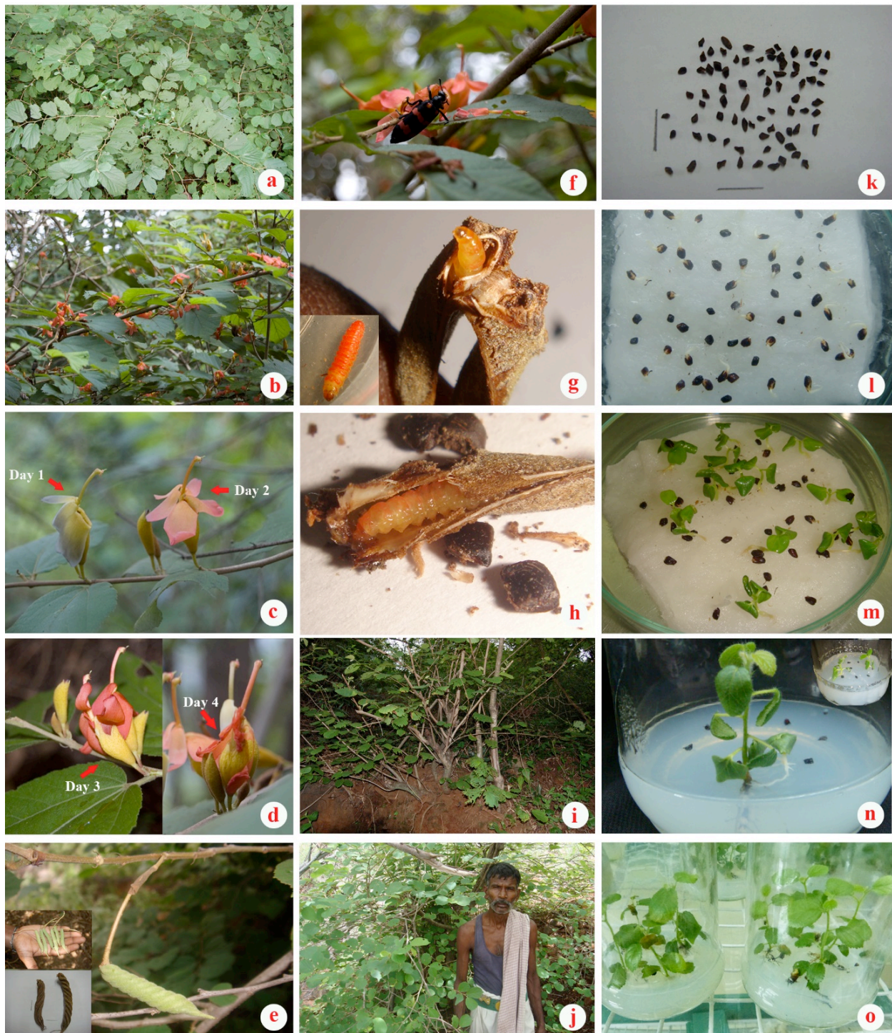
Image 1. Phenology, problems in fruit setting, distribution and in vitro seed germination of H. isora .

a - H. isora habitat; b-d - flowering; e - fruits (fresh and dried); f - Blister beetle ( Mylabris pustulata ) eating flower of H. isora ; g & h - unidentified larvae presents inside H. isora fruit follicle feeding seeds; i - trimming of developing branches; j - local tribe in fruit collection; k - seeds from single matured fruit; l - seed germination in cotton bed; m - seedling development in cotton bed; n - seed germination and development in MS medium; o - germinated seeds developed in \frac{1}{2} MS medium.