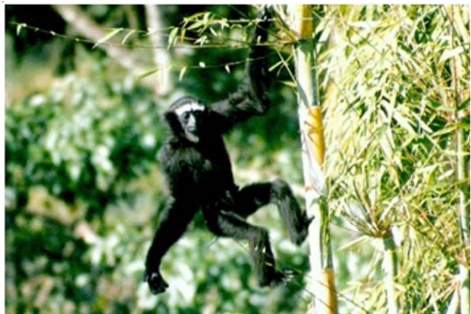
Image 5. Juvenile male in bamboo forest.