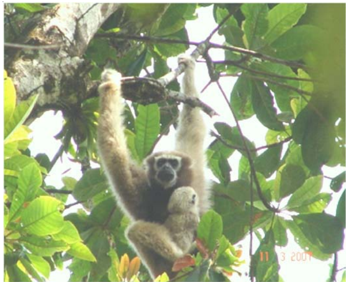
Image 4. Female carrying newly born infant.