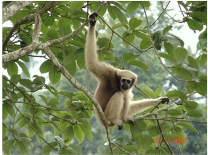
Image 3. Pregnant female gibbon.