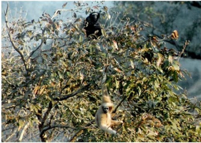
Image 1. A pair of adult male and female gibbons feeding.