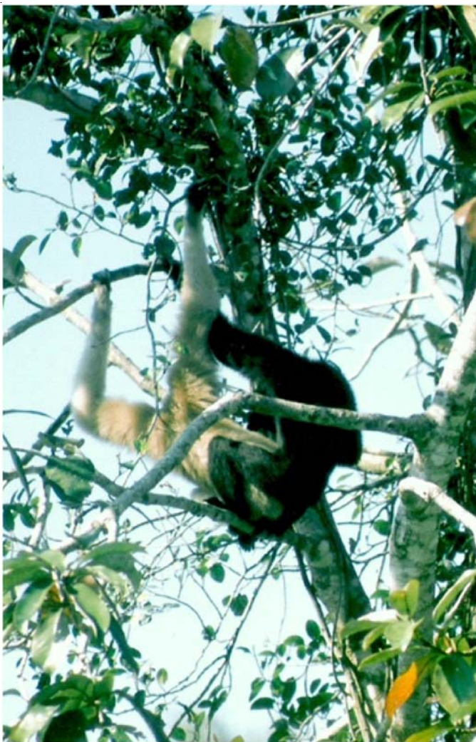
Image 2. Adult male and female gibbons in copulation.