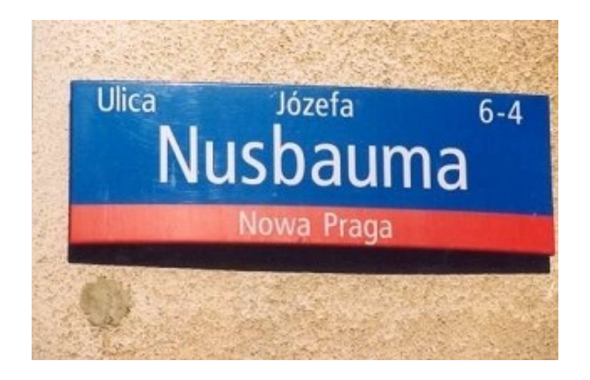
Figure 1. A street in Warsaw (Poland) is named after the famous Darwinist and comparative anatomist Józef Nusbaum (1859–1917) from the University of Lwów (today Ukraine).

<sup>a</sup> The first publication is regarded as the career starting point in fish immunology; <sup>b</sup> M. Michael Sigel (1920–1995) emigrated from Poland to the USA in 1937. For additional information on M.M. Sigel see Van Muiswinkel [2].