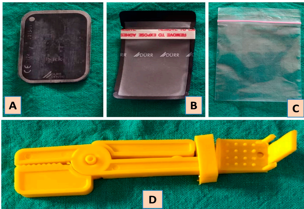
Figure 3. Intra oral radiography films and accessories. (A) Phosphor Storage Plates (Sensor); (B) Disposable sleeve for the sensor; (C) Outer (double barrier) transparent disposable sleeve for the sensor; (D) Eezee Grip/Snap A Ray Film holder for intra oral radiography.